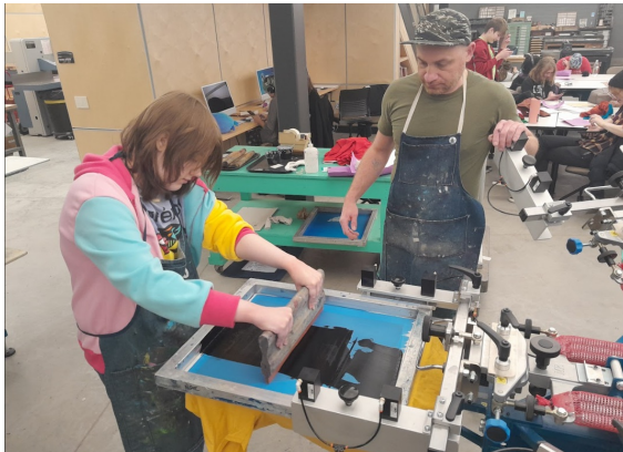
Business of Merch -MATC screen printing