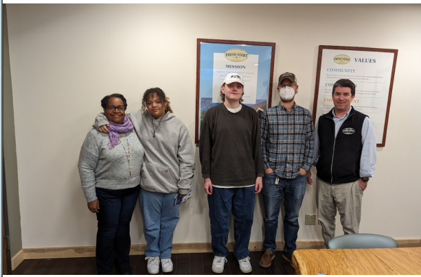
Work It! - Catalyst for Change ride along