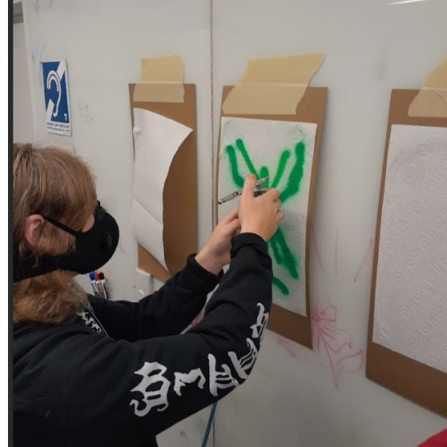
Business of Merch - Airbrushing