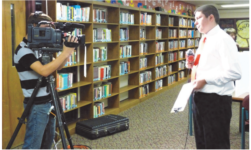
DTV provided on-air election updates at the beginning of every class hour.