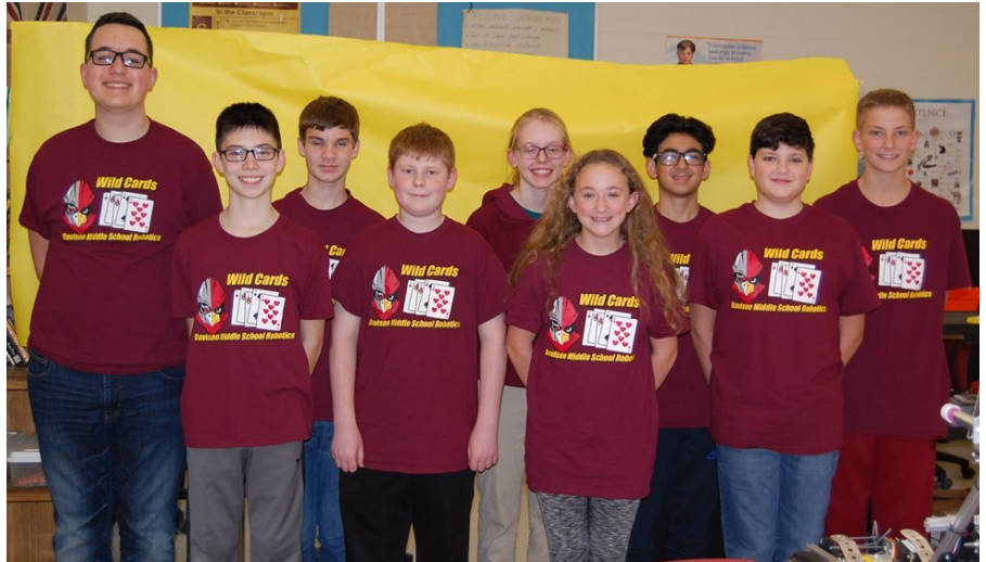
The eighth grade team, The Wild Cards, was the first DMS team to ever play a match in the semi final rounds at State.