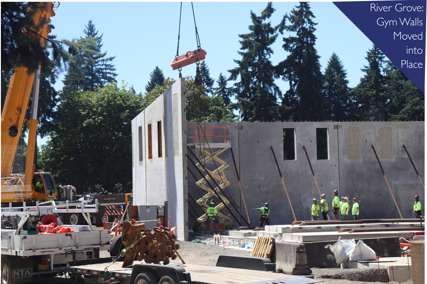
River Grove: Gym Walls Moved into Place