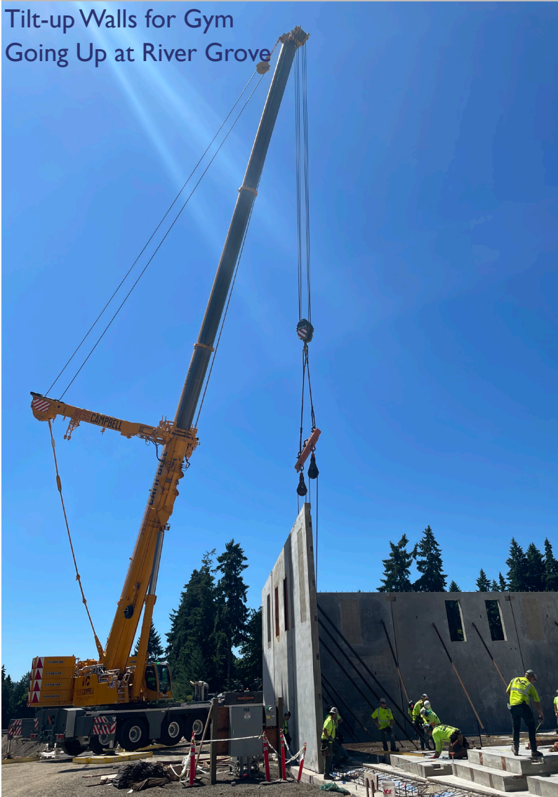
Tilt-up Walls for Gym Going Up at River Grove