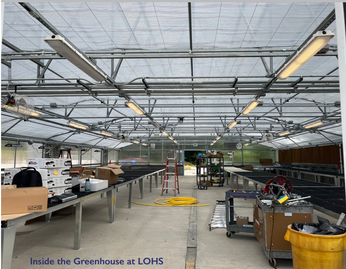
Inside the Greenhouse at LOHS