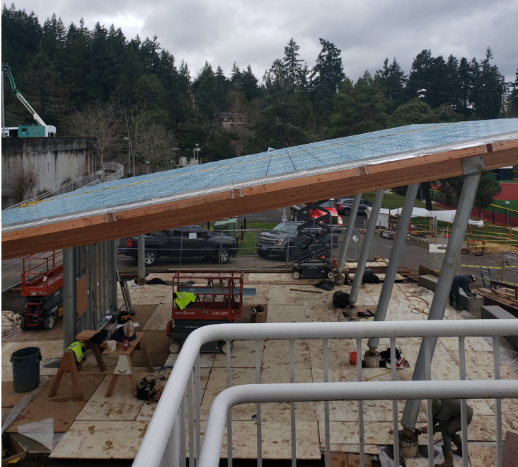
Lakeridge High School Outdoor classroom view from B-wing stairs