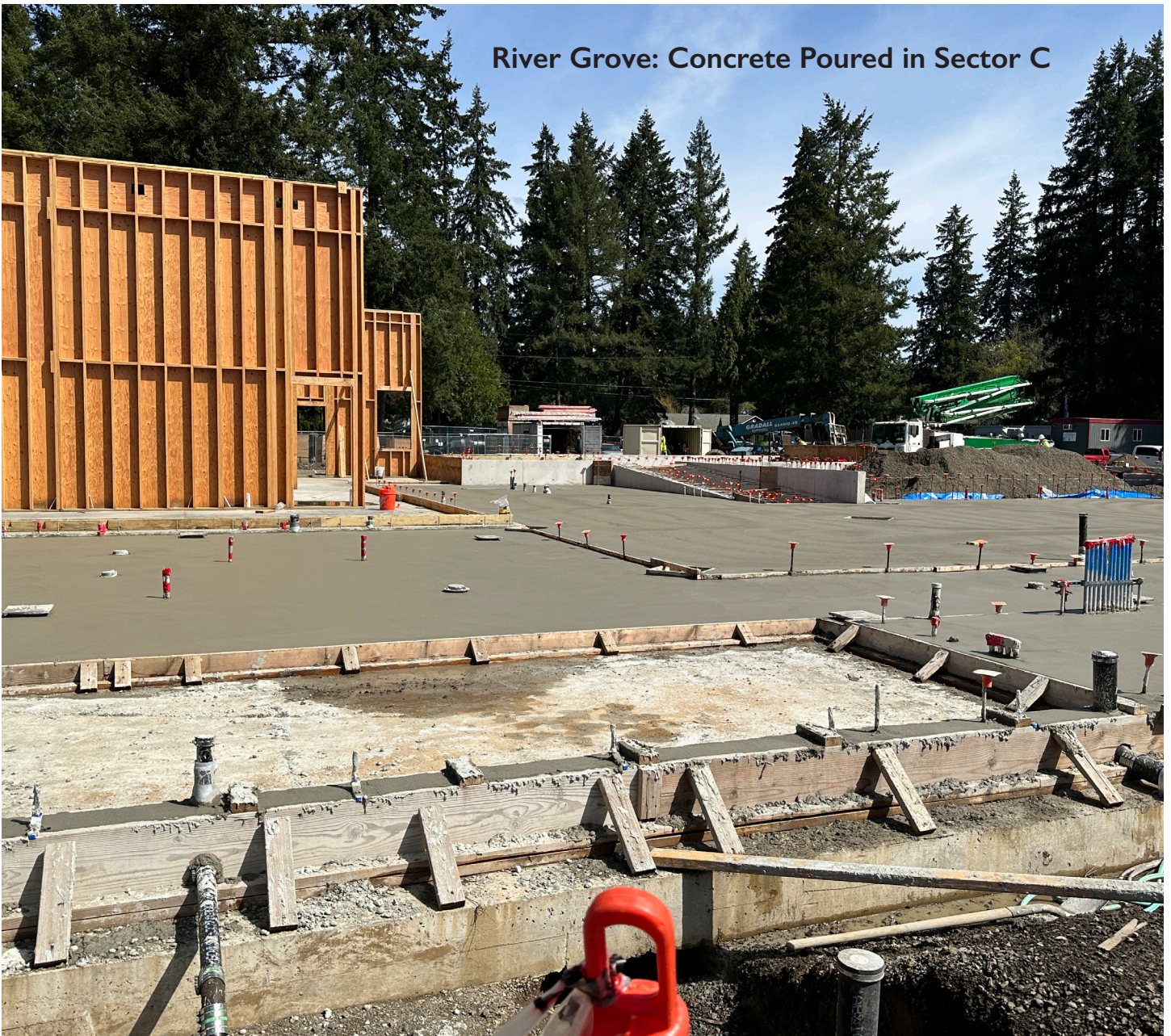
River Grove: Concrete Poured in Sector C