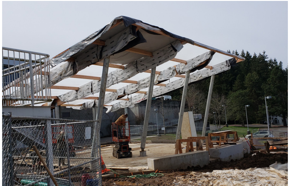
Lakeridge High School: Outdoor CTE Project