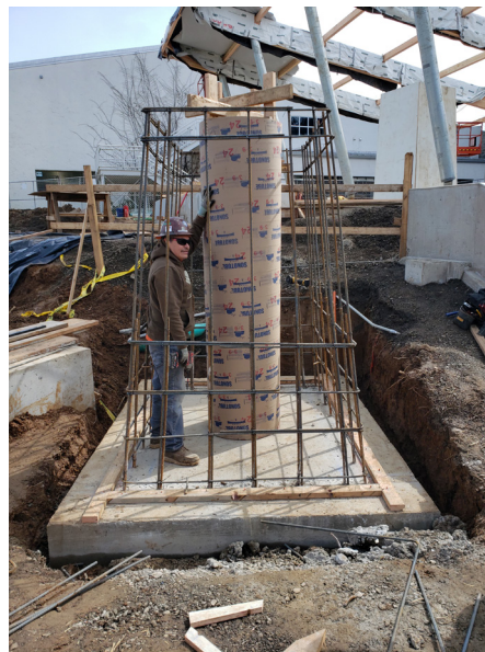
Solar Flower Pedestal