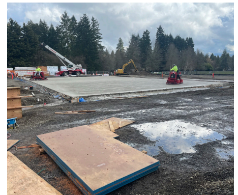
Concrete Pour at River Grove for Gym (above) and Sector C (below)