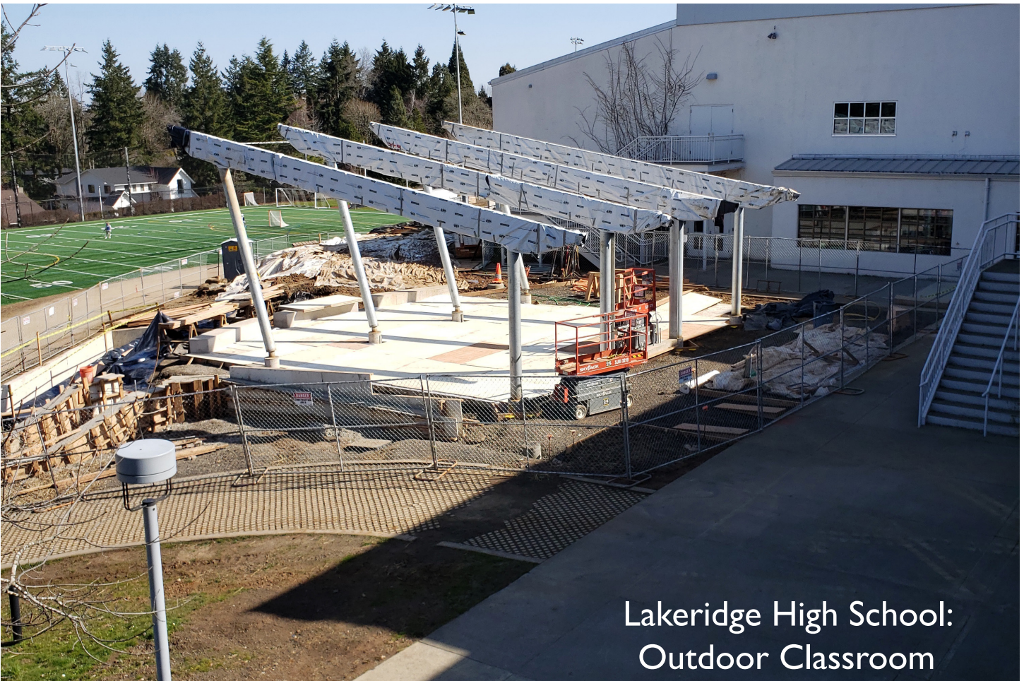
Lakeridge High School: Outdoor Classroom