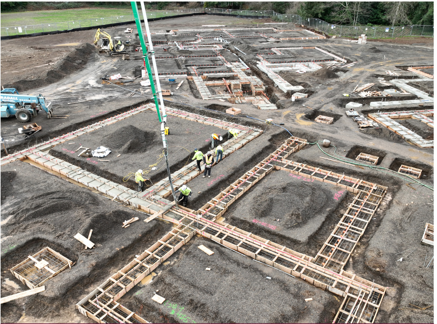
Concrete Pour in Sector C at River Grove Elementary