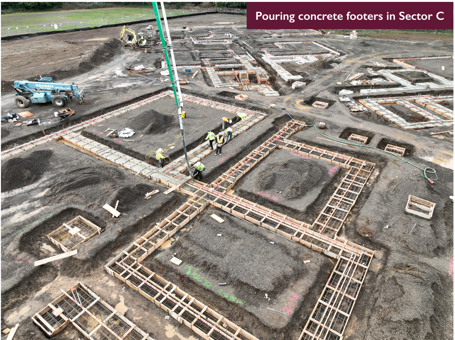
Pouring concrete footers in Sector C