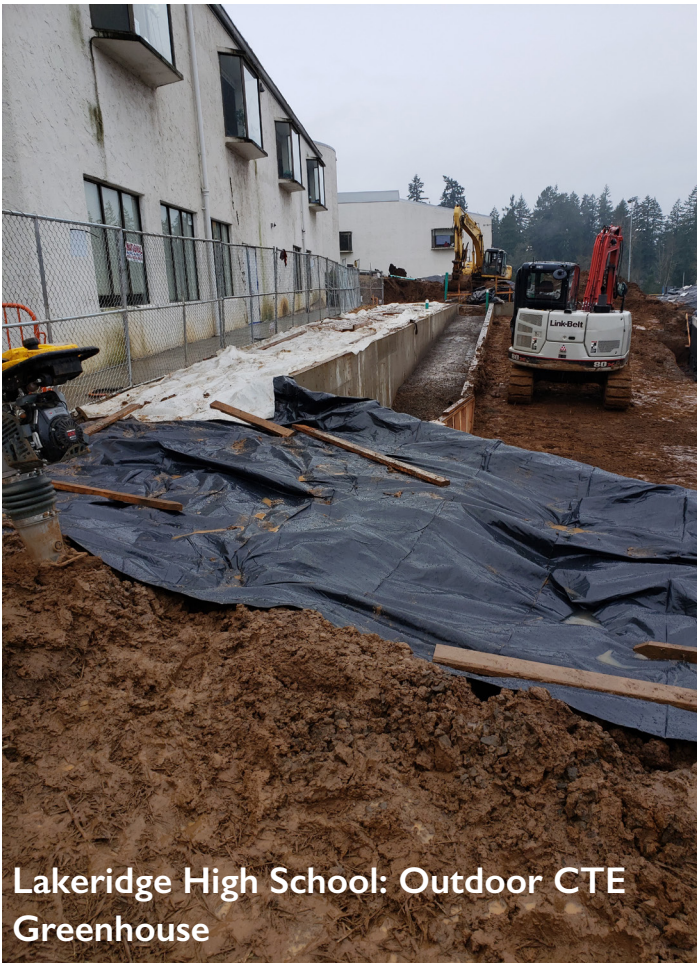
Lakeridge High School: Outdoor CTE Greenhouse