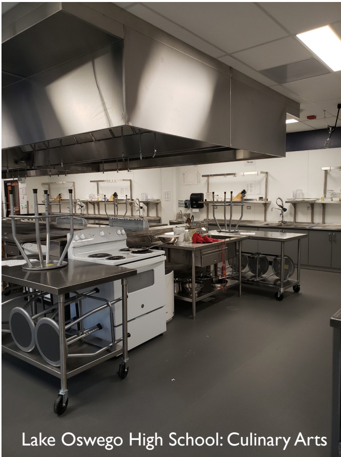
Lake Oswego High School: Culinary Arts