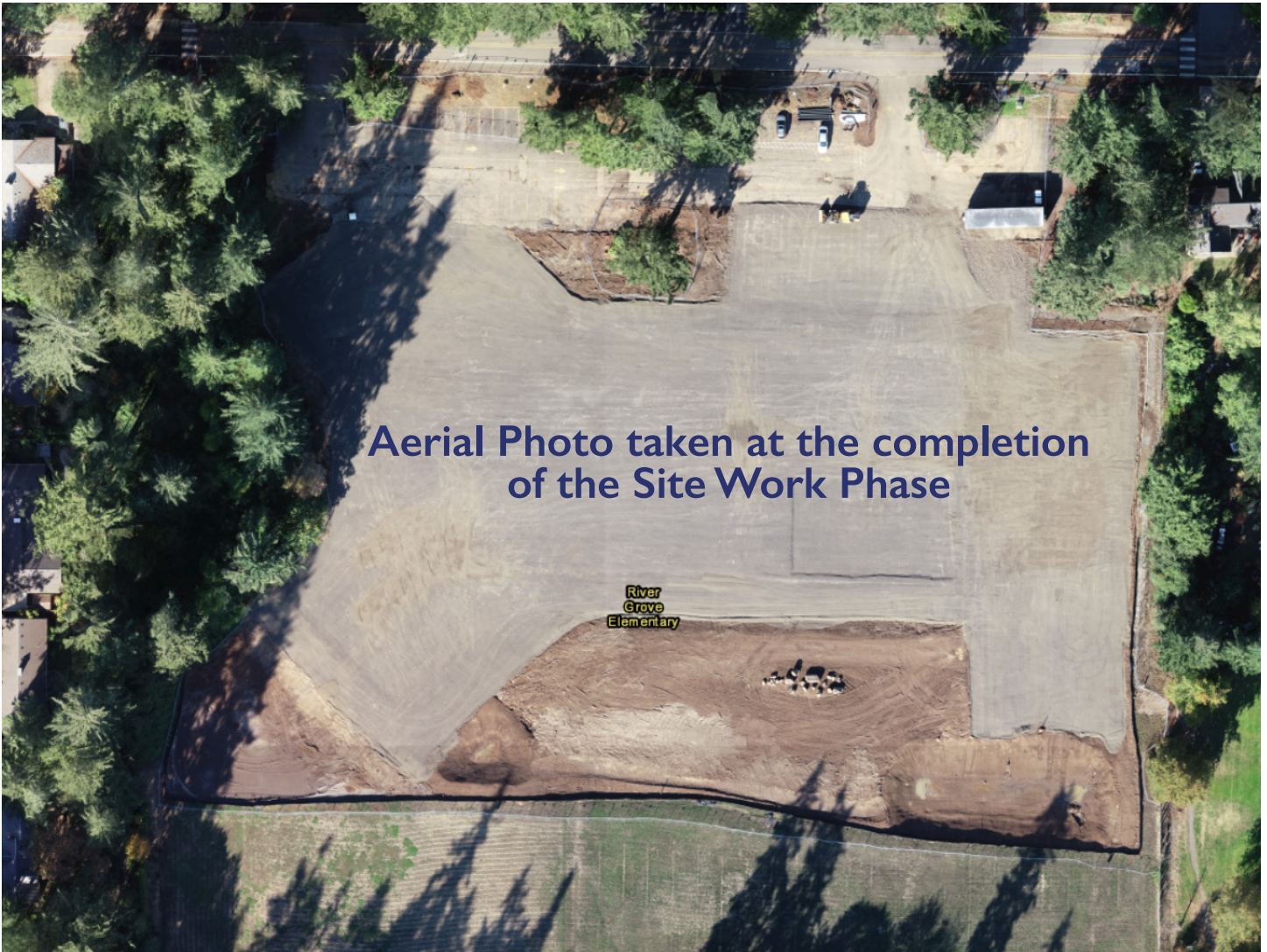
Aerial Photo taken at the completion of the Site Work Phase