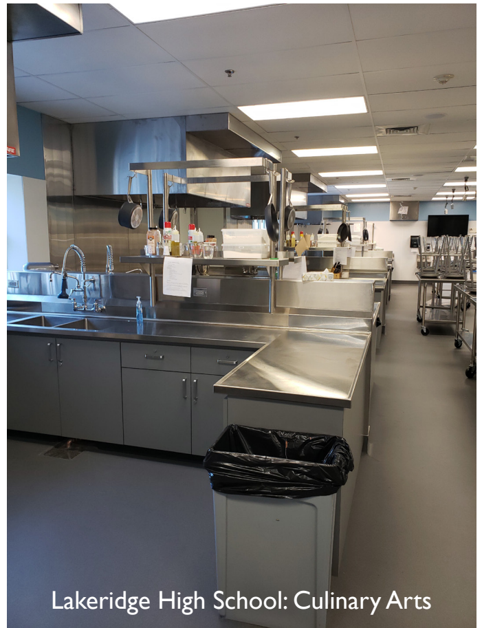
Lakeridge High School: Culinary Arts

Lake Oswego High Lakeridge High Tech Infrastructure