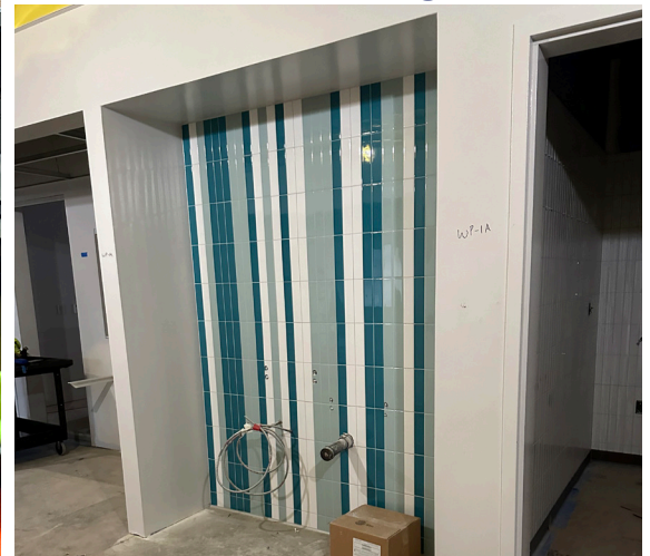
Tile at handwashing station