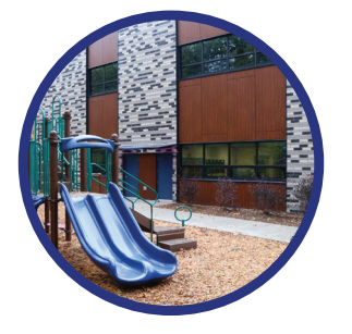
New exterior for Oak Creek Elementary