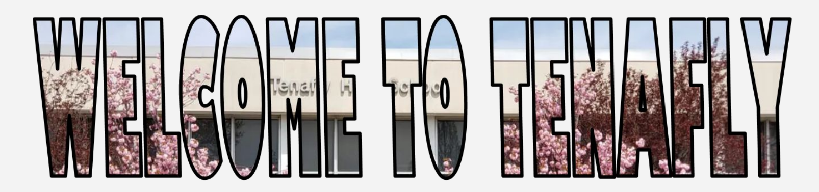
The 9th Grade Experience