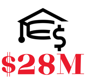
endowment to support scholarship and faculty development