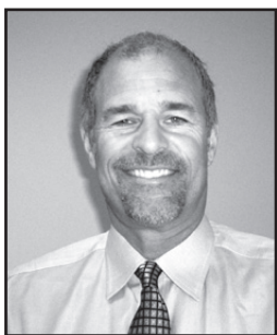
John E. Fulmer Middle School Principal

We have finished a successful year at the Middle School. Students and staff have both worked very hard toward accomplishing the goal of high academic achievement and an increasing degree of proficiency. The students' physical, social and academic growth was evident throughout the grade levels.