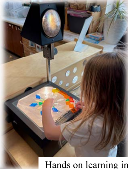
Hands on learning in the Pre-K classroom.