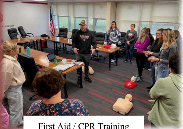
First Aid / CPR Training