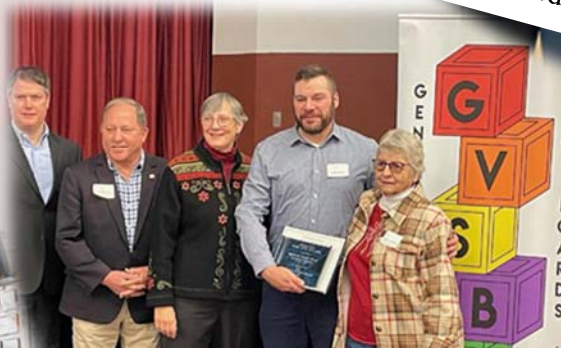
The Transportation Department received the GV BOCES Excellence In Student Services Award.