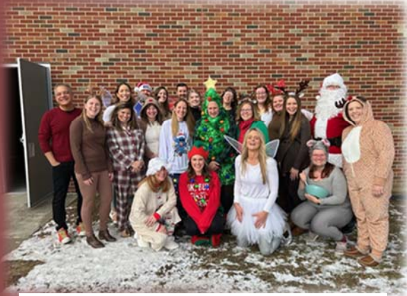
Cast of the Elementary Christmas Play