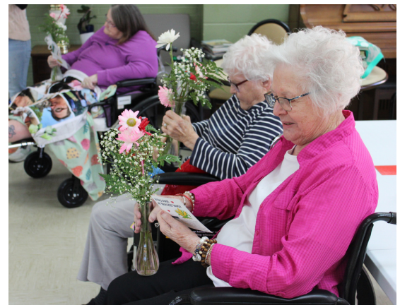
Above: Residents enjoy the gifts created by the Floral Design class just prior to the group's departure.