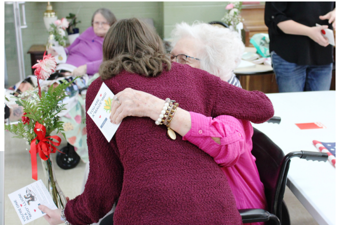
Above:... and then both gives and receives affection which was apparent throughout the facility on this day.