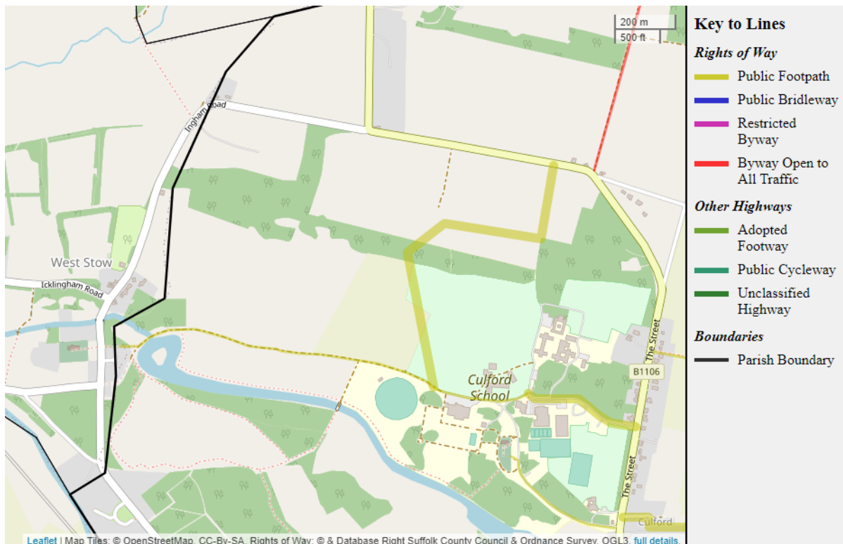
Image taken from OpenStreetMaps © and can be access digital through their website.