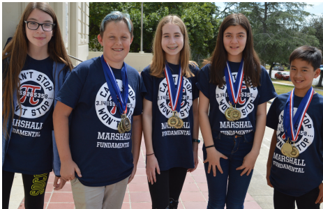
6th Grade Team A

Middle School 8th Grade Team A Conceptual Learning – Gold Computational & Procedural – N/A Problem Solving - Gold Middle School 8th Grade Team B Conceptual Learning – Silver Computational & Procedural – Gold Problem Solving - Bronze