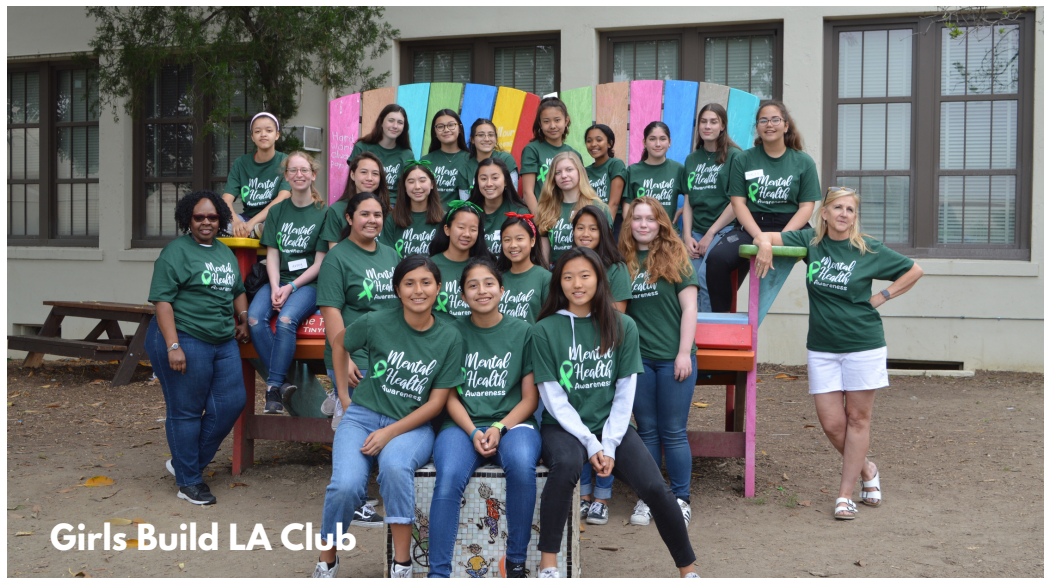
Girls Build LA Club