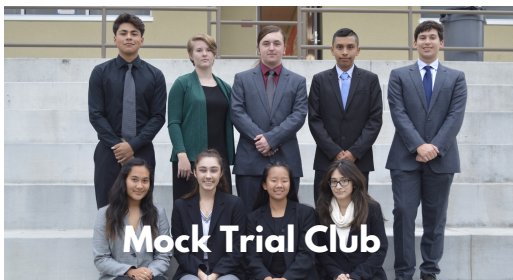
Mock Trial Club