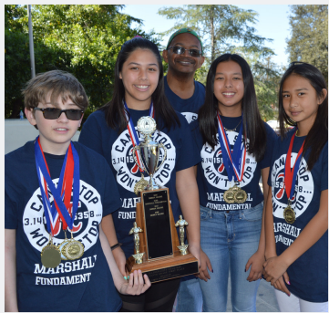
7th Grade Team A

Middle School 7th Grade Team A Conceptual Learning – Gold Computational & Procedural – Gold Problem Solving - Silver Middle School 7th Grade Team B Conceptual Learning – Silver Computational & Procedural – Silver Problem Solving - Silver