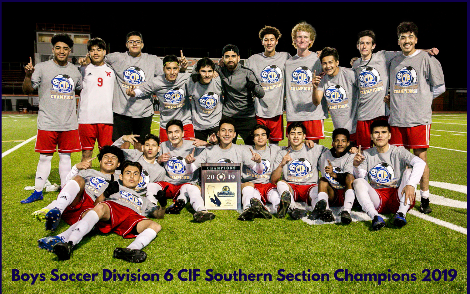
Boys Soccer Division 6 CIF Southern Section Champions 2019

990 North Allen Ave, Pasadena, CA 91104 626.396.5810 pusd.us/mashall