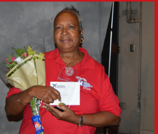
LEAD WITH INTEGRITY