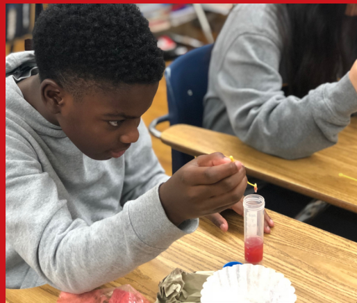
ENAGAGE IN LEARNING