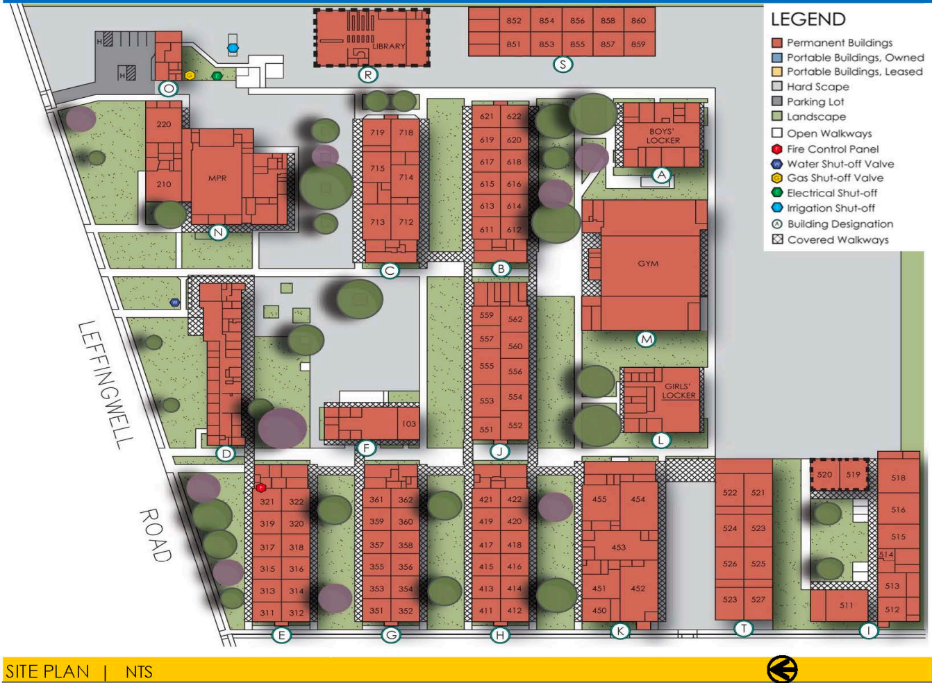
SITE PLAN | NTS

NORWALK HIGH SCHOOL | 11356 Leffingwell Rd, Norwalk, CA 90650