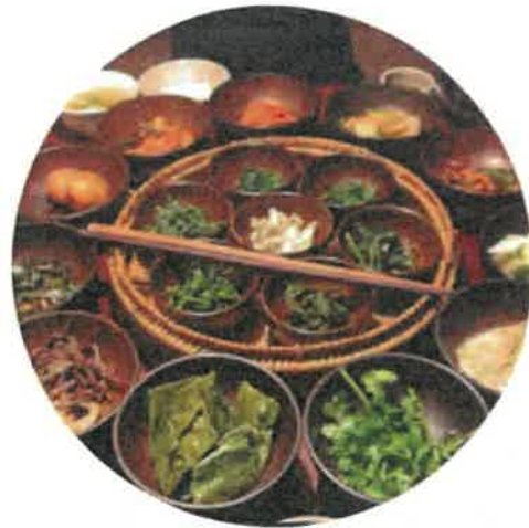
Cultural spotlight: Korea

Westwood Community Kitchen invites you to explore culture through food