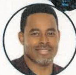
LAMMAN RUCKER ACTOR, HEALTH & COMMUNITY ADVOCATE, SPEAKER