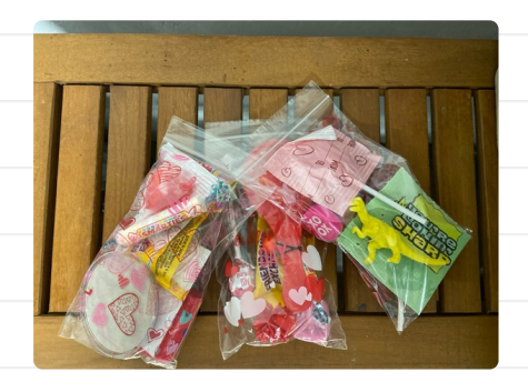
Little Candy Bags $3.50