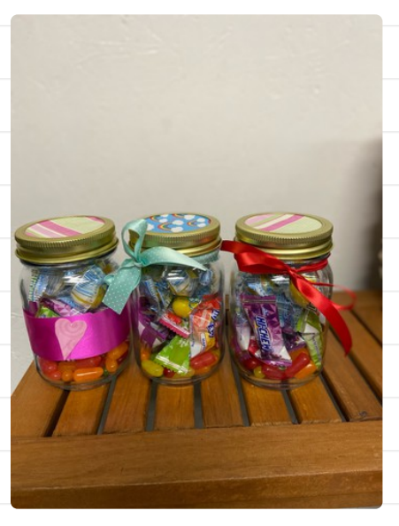
Sweet and Sour Candy Jars $8