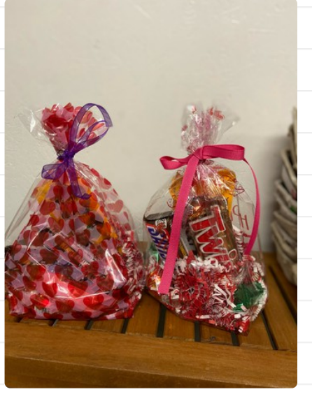
Large Candy Bar Bags $8.50