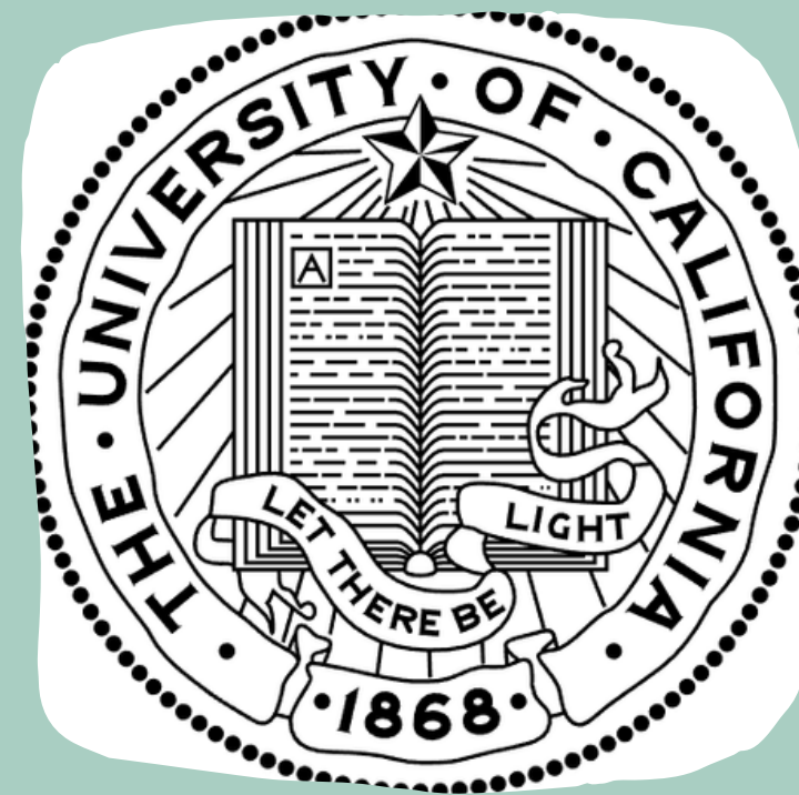
University of California (UC)