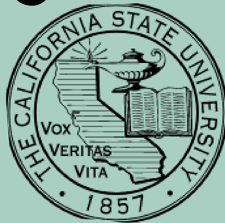
California State University (CSU)