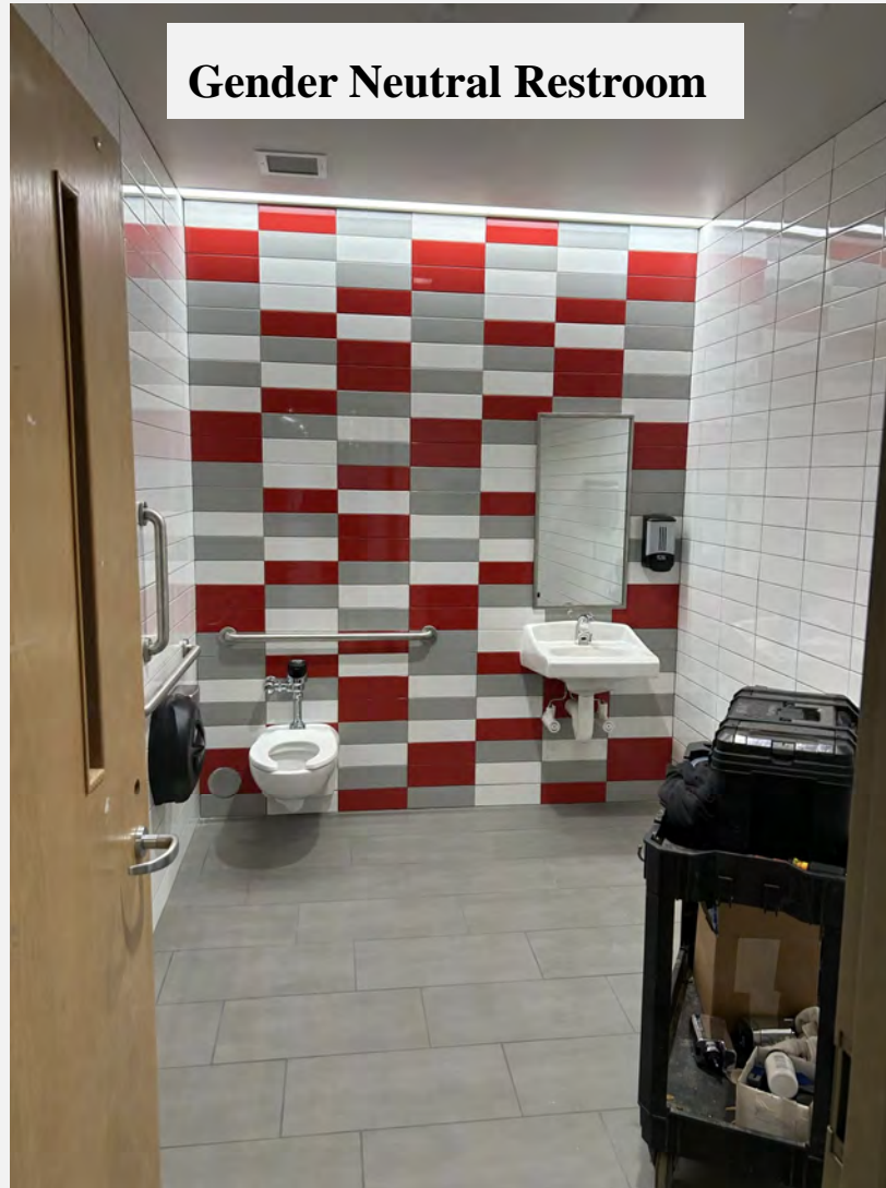
Gender Neutral Restroom