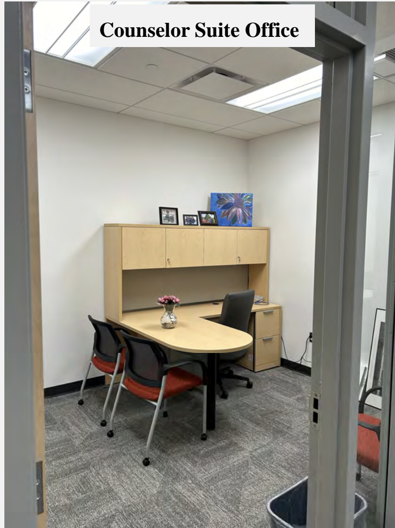
Counselor Suite Office