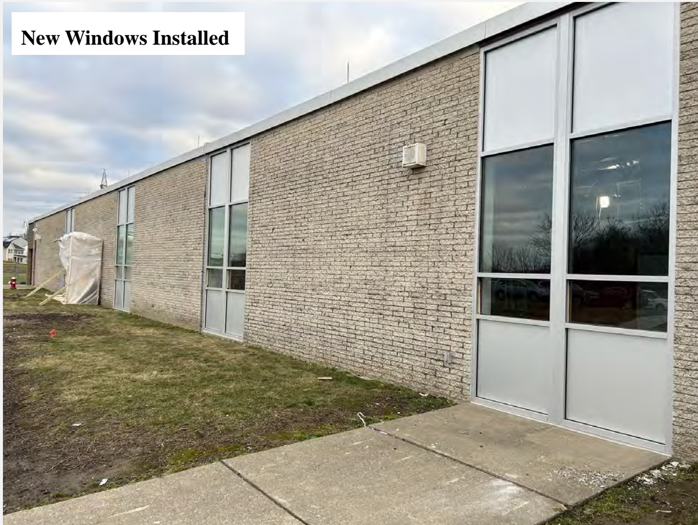
New Windows Installed