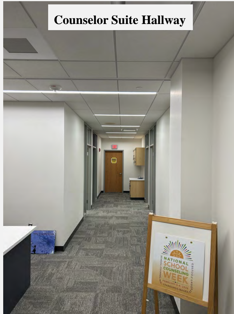
Counselor Suite Hallway