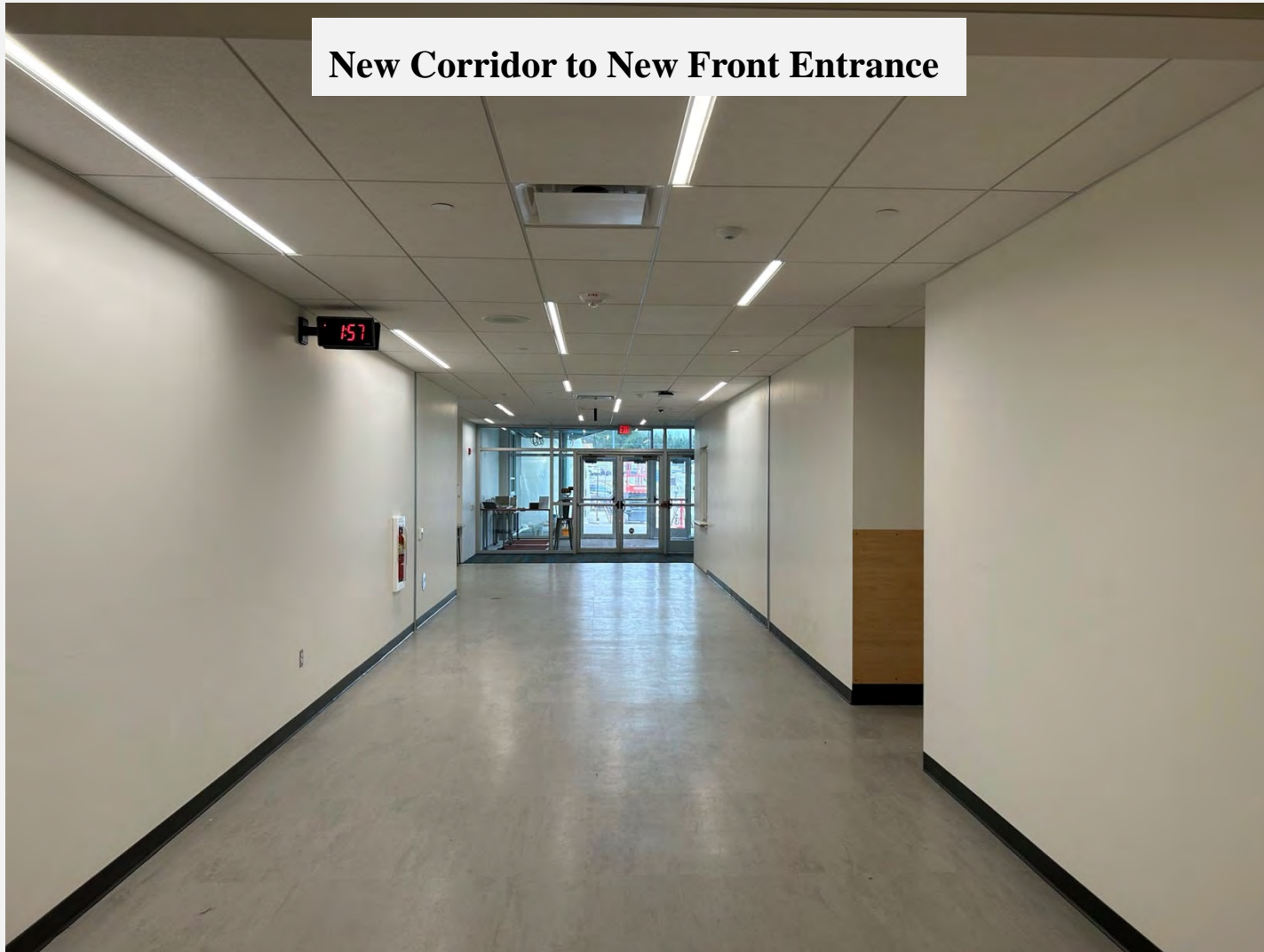
New Corridor to New Front Entrance