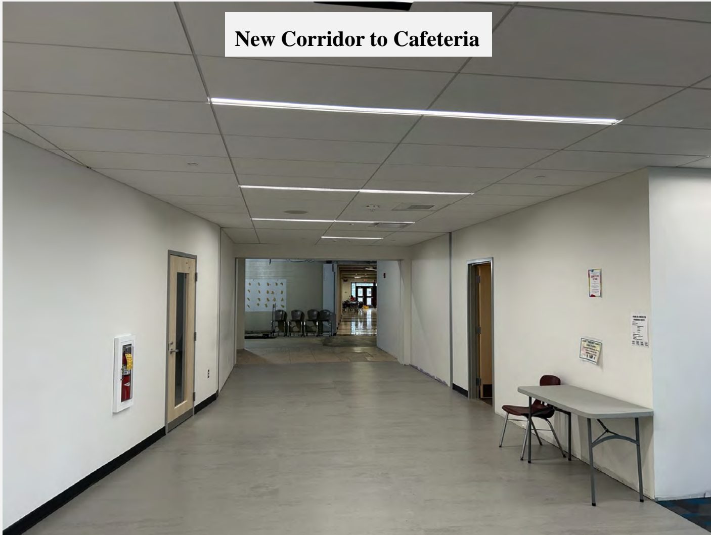
New Corridor to Cafeteria