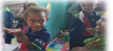
A lot of interaction between children on their first few days of school