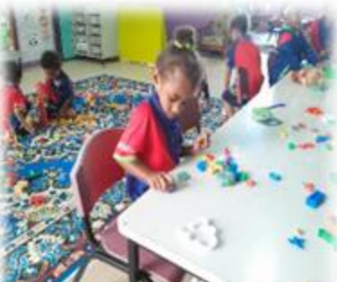
Tiffany is in the library looking happy to find a teddy bear to cuddle