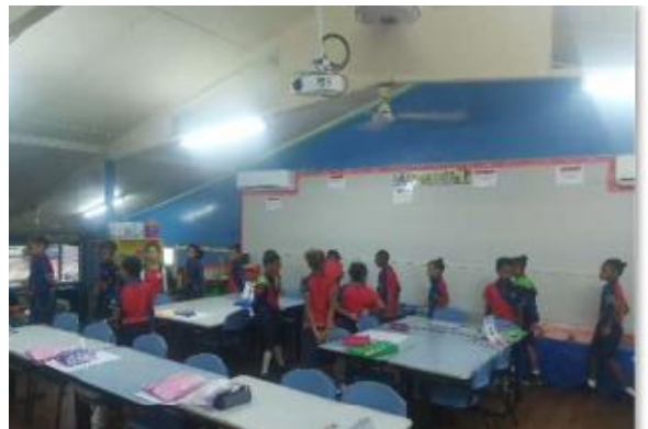
Demonstrating a Responsible and Respectful learner by moving sensibly in line to wash their hands for lunch break.