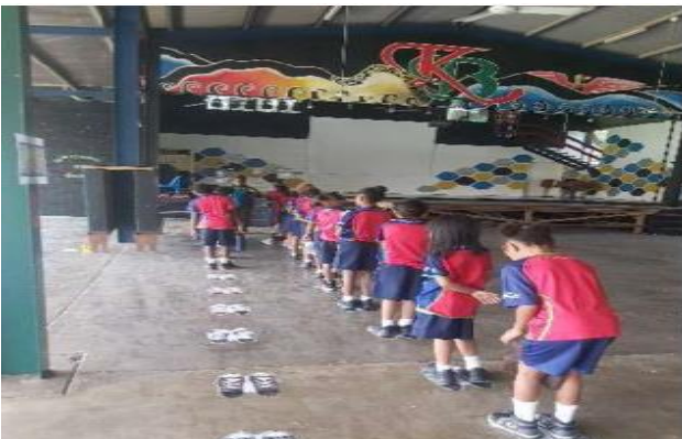
Miss Sapak modelled and allowed students to role play the Dance lesson expectations.