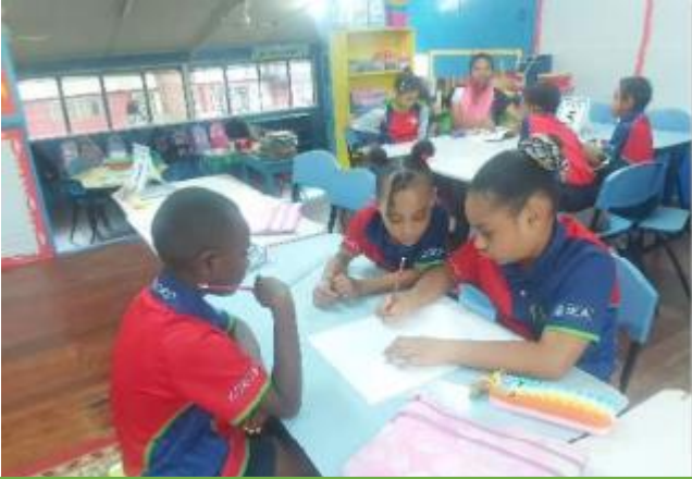
Working collaboratively in groups to brainstorm ideas about how it Sounds Like and Looks Like in specific learning areas in the classroom and around the school areas.

Below are some snapshots of students applying their PB4L expectations around the school. Following these keep us safe at all times.