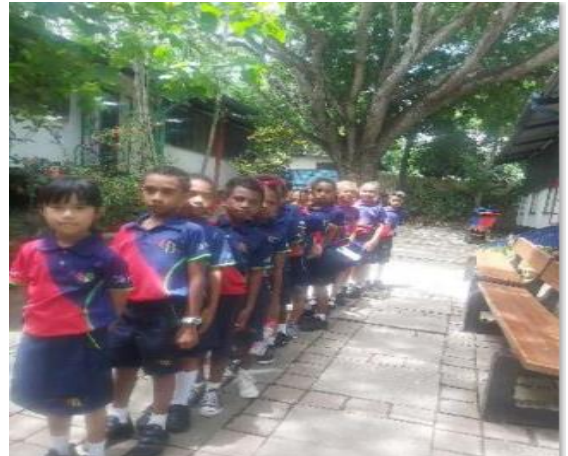
Standing sensible in line to move to the hall for their dance lesson.