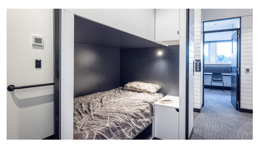
Harlin House (Years 9 to 12) ▲ Griffith House (Years 5 to 8) ▼

Harlin House is home to boys in Years 9 to 12. Individual rooms provide a space to recharge, while social areas foster connection.