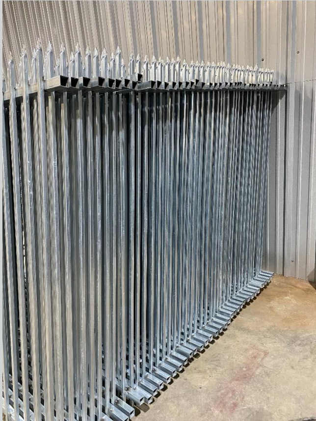
Panels in production