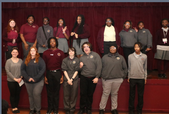
Advertising & Design