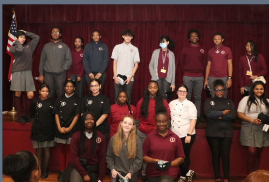
Culinary & Pastry Arts