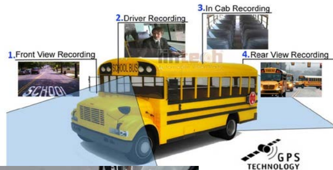
Internal Cameras Surveillance Area: