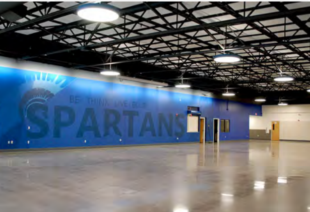
Hilhi remodeling (commons)