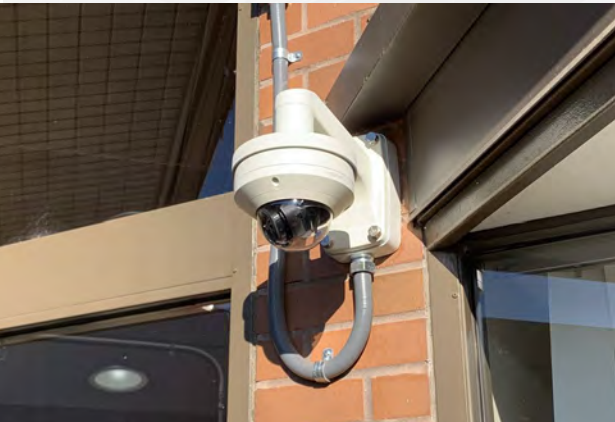
Exterior security camera