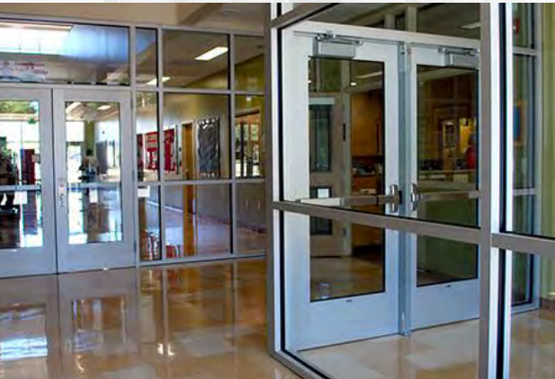
Free Orchards, as of Aug. 29, 2022