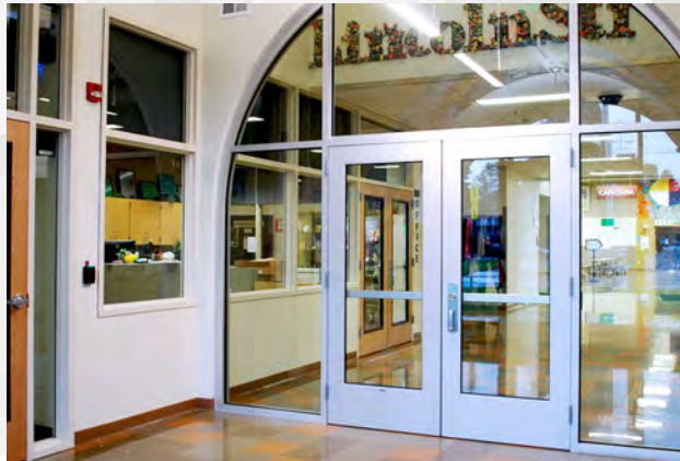
Lincoln Street, as of Nov. 4, 2022