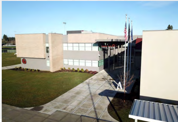
Glencoe media center/classroom addition