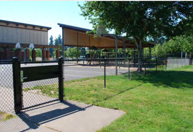
Orenco, as of June 27, 2022