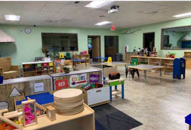
Century early childhood education building