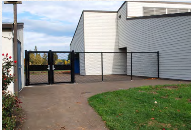
Lenox, as of Nov. 11, 2022