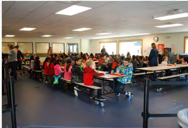
Reedville remodeling (new cafeteria/modular building)