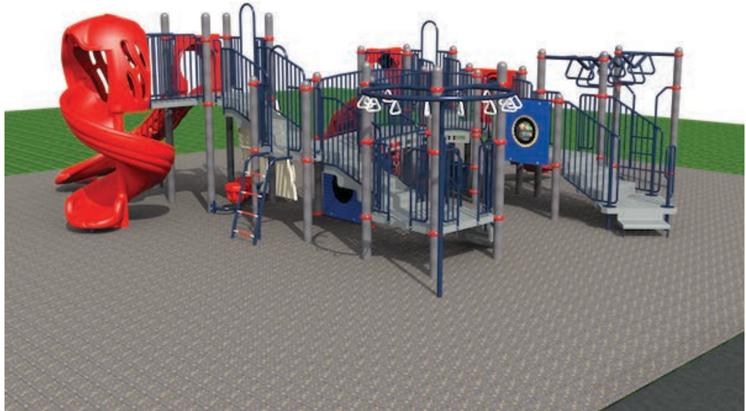
Representative play structure