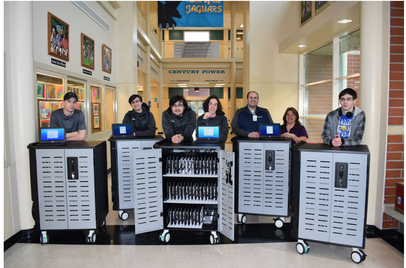
Technology rollout: 117 Chromebook carts (total 4,680 devices) were distributed to schools January-April 2018.