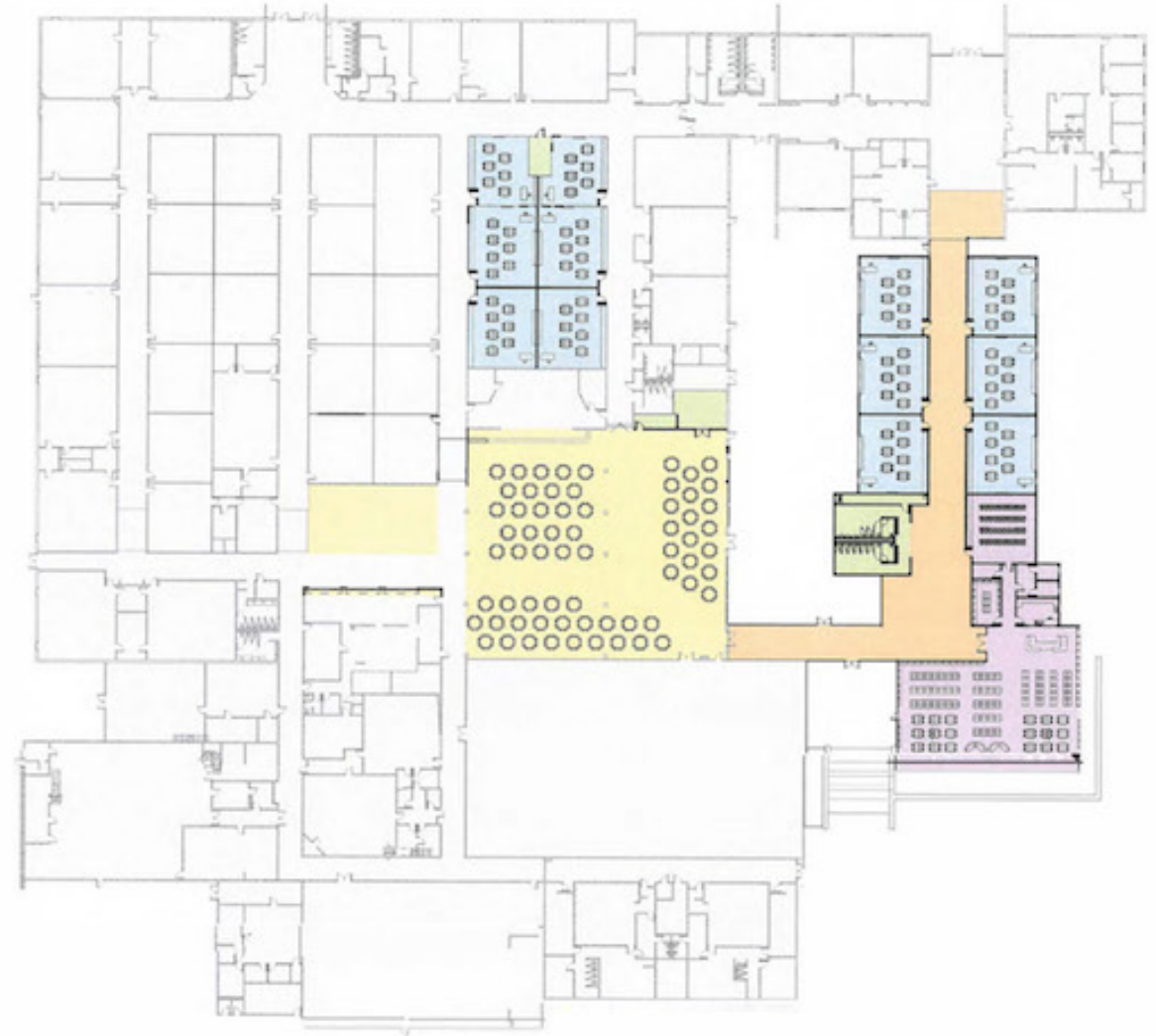
FLOOR PLAN - OVERALL (preliminary)