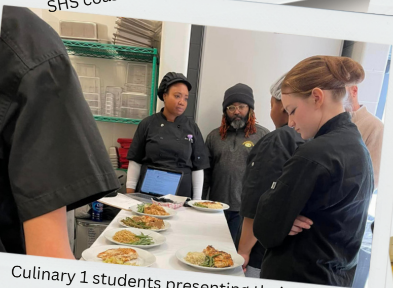
Culinary 1 students presenting their final exam. Meals were critiqued by professional chefs!