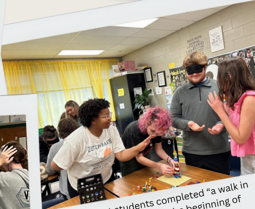
Teacher Cadet students completed "a walk in their shoes" activities at the beginning of Semester 2.