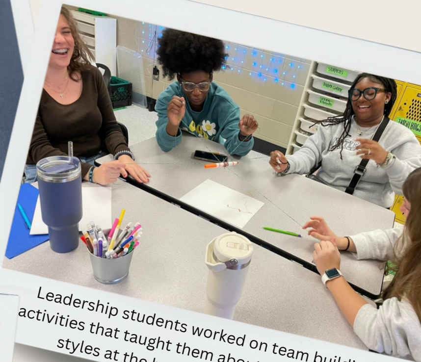
Leadership students worked on team building activities that taught them about their leadership styles at the beginning of Semester 2!