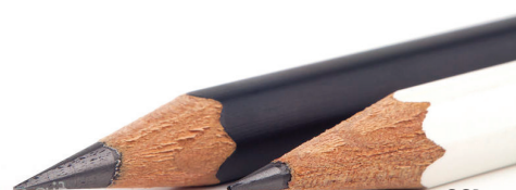
CCP not included