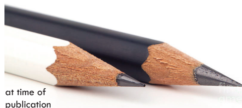
at time of publication