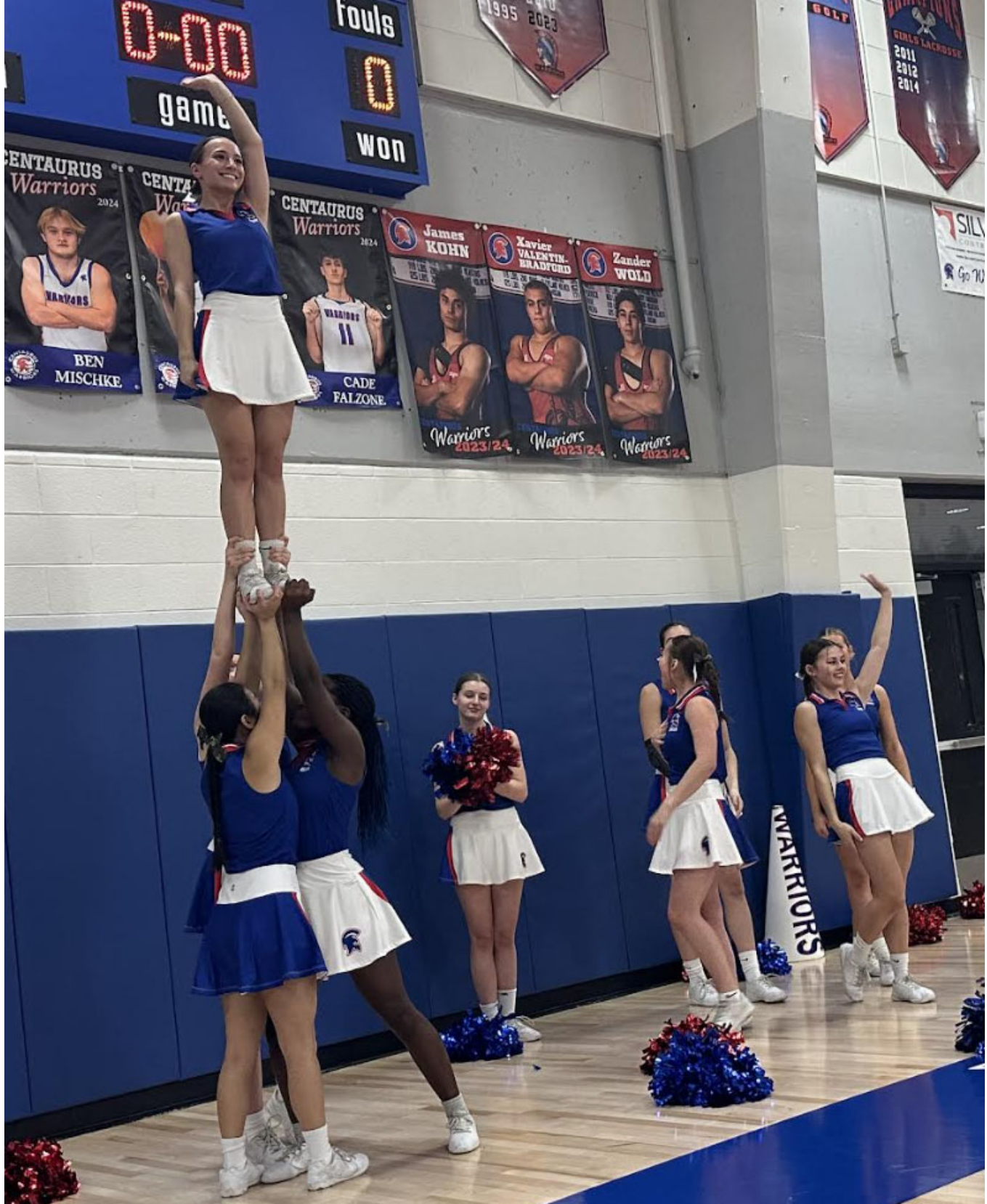
Celebrating Centaurus Seniors