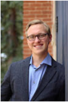
noname 155K View Download