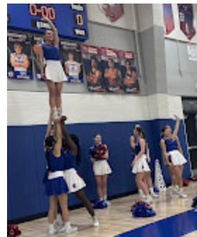
noname 981K View Download

7 attachments — Download all attachments View all images