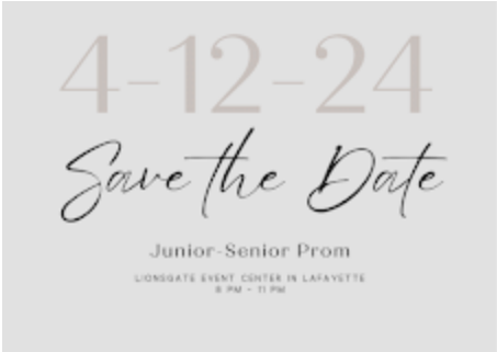
noname 23K View Download