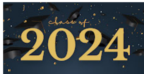
noname 306K View Download