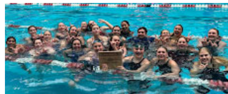
noname 1002K View Download