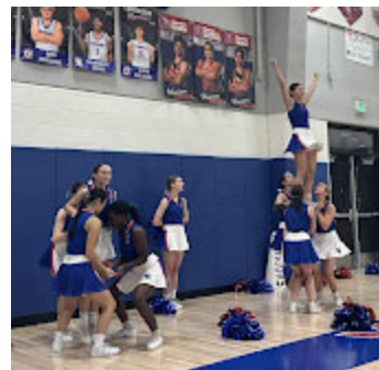
noname 952K View Download