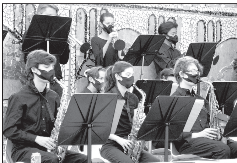
Below: Members of Advanced Jazz perform in the quad.