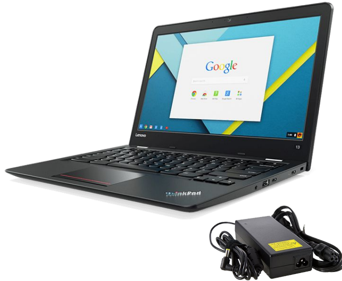
Chromebook & Power Cord