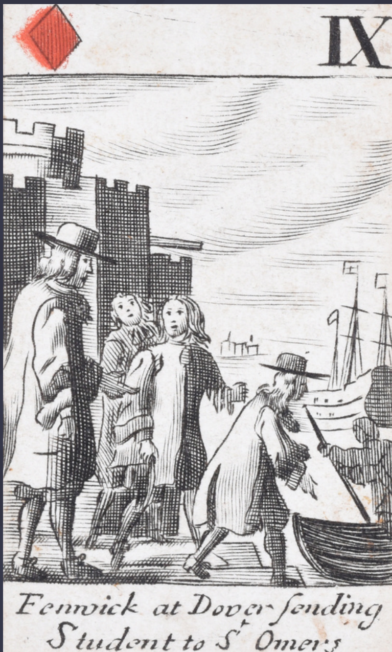
Popish Plot Playing Card, 17th century

Stonyhurst is a Jesuit, Catholic school with a tradition of excellence that seeks to develop the full human potential of its pupils to live lives of faith and justice as citizens of the world.