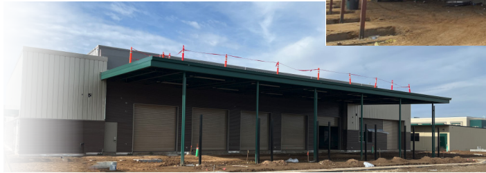
Transportation CTE Building Top Right Photo: August 2023 Bottom Left Photo: January 2024