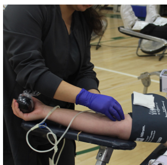
Medical Academy Blood Drive was held on December 19th.