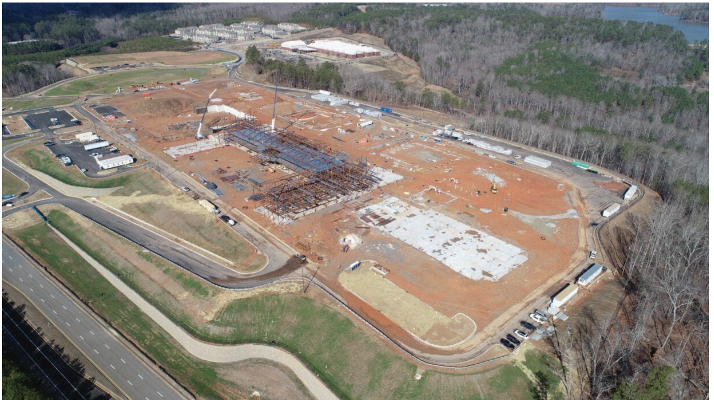
Aerial ~ Main Academic and CTAE Buildings