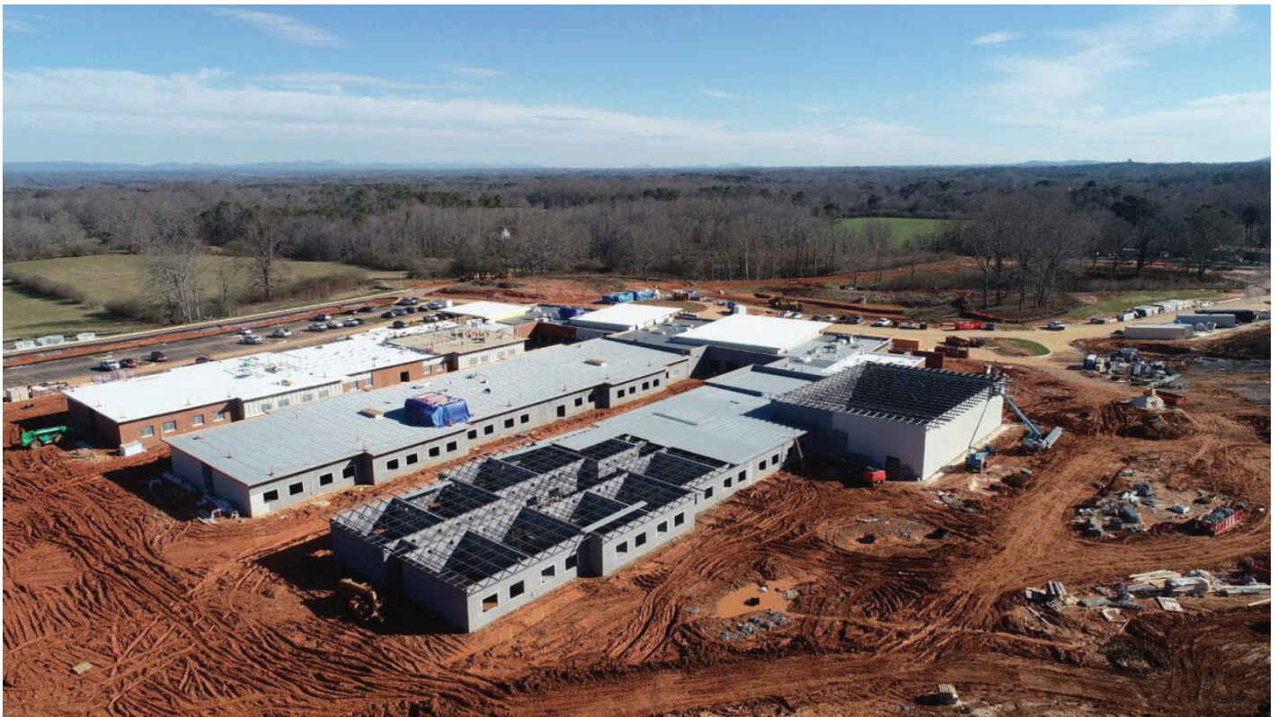
Aerial ~ Rear of School