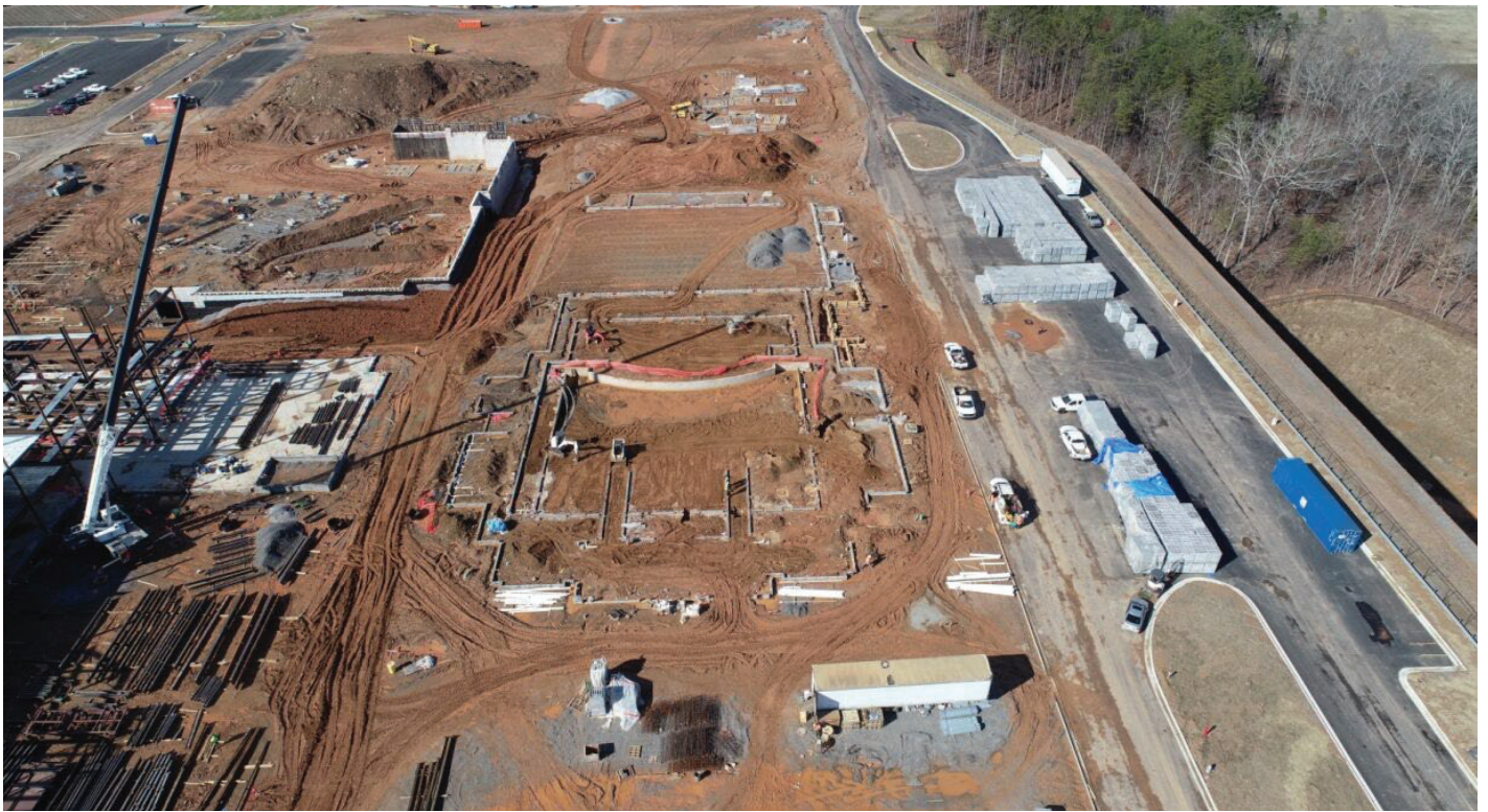
Aerial ~ Auditorium and Auxiliary Gym Footprint