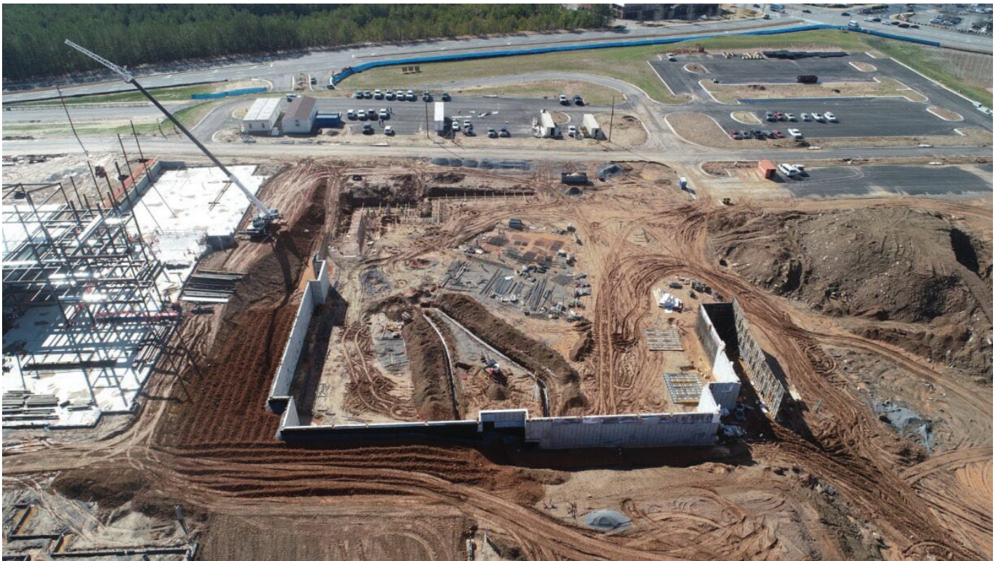
Aerial ~ Main Gym