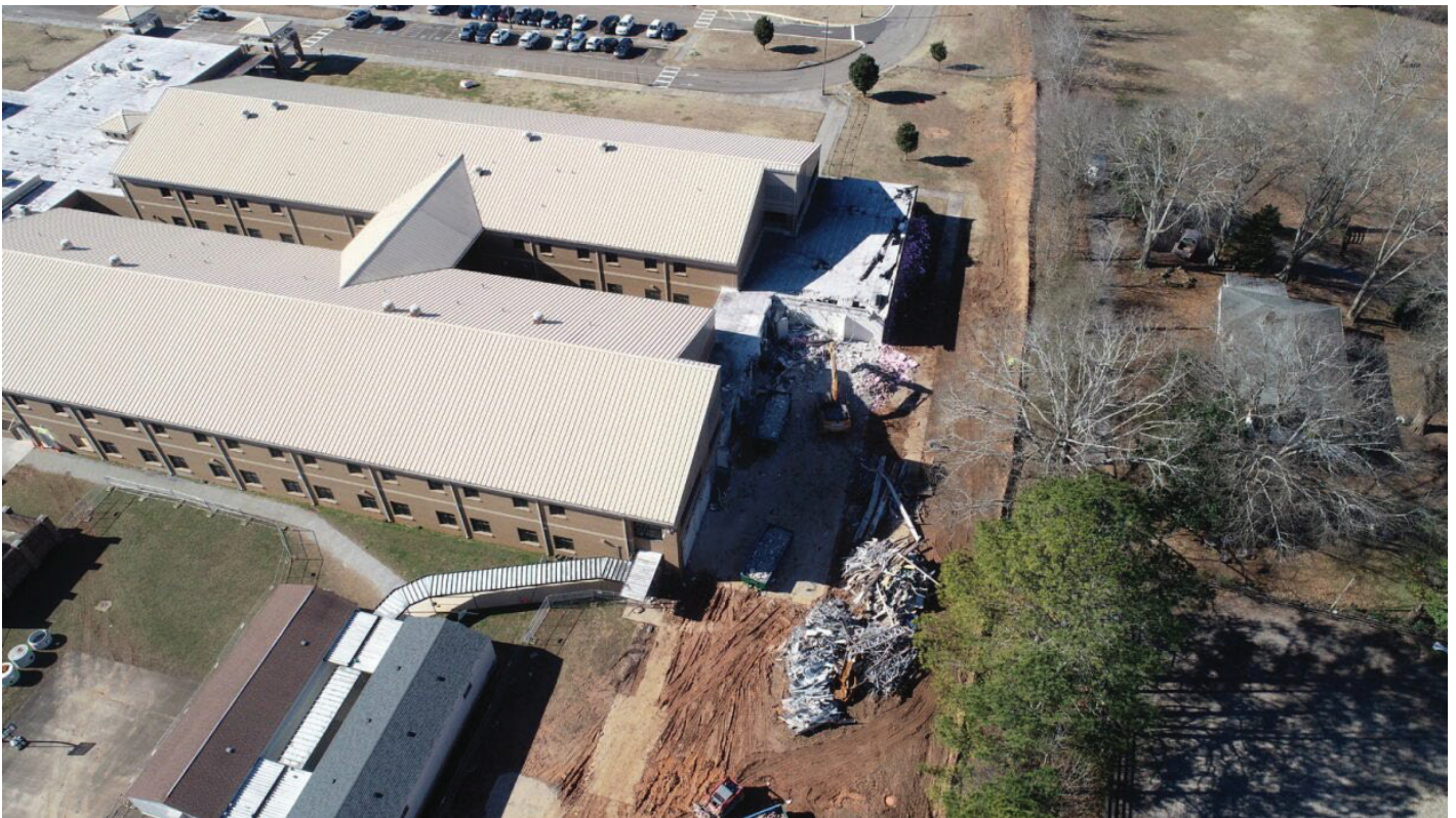
Demolition of Existing Building