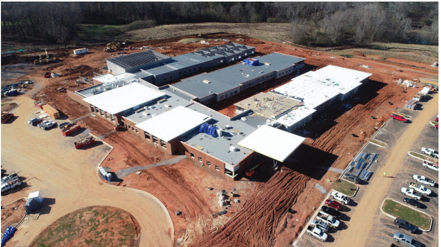
Aerial ~ Front of School