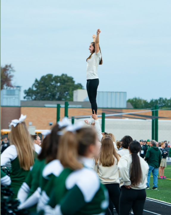
Above: APHS Cheer alumni stunt on the sidelines during the game.