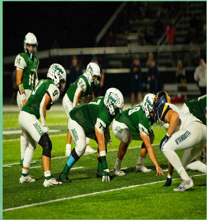
Above: Jags Football lines up against Trenton.