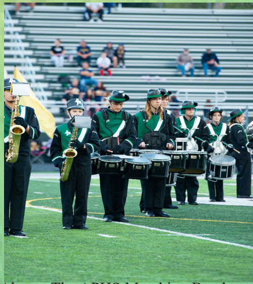
Above: The APHS Marching Band performing during the homecoming halftime performance.