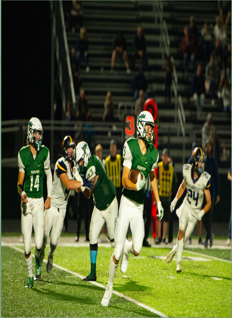
Above: Jags Football runs the ball down the field.