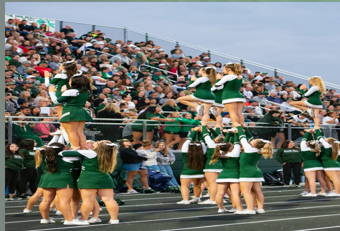
Above: APHS Varsity and JV Cheer perform .