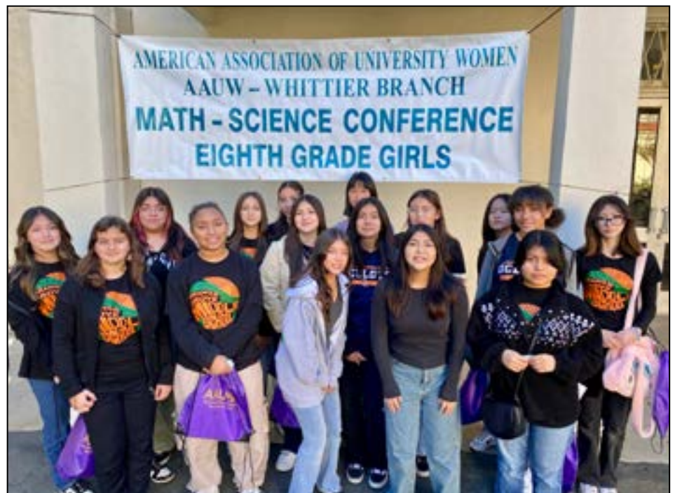
Eighth-grade students from Orange Grove Middle School share the highlights from the American Association of University Women (AAUW) Math and Science Conference with their peers on January 11.