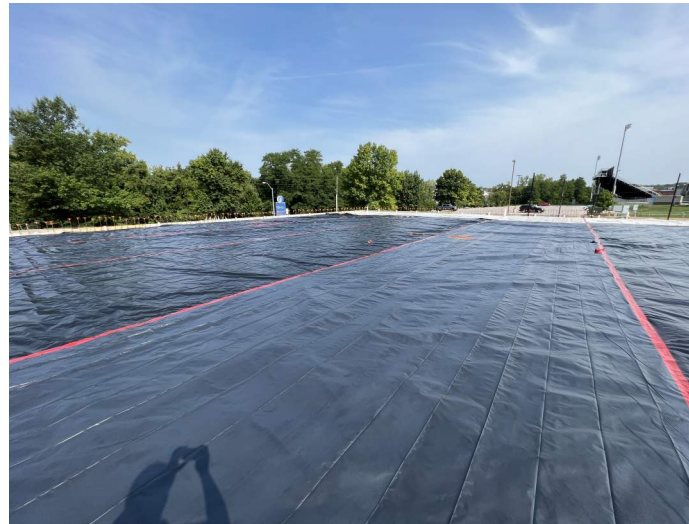
North Court Vapor Barrier for PT Slab