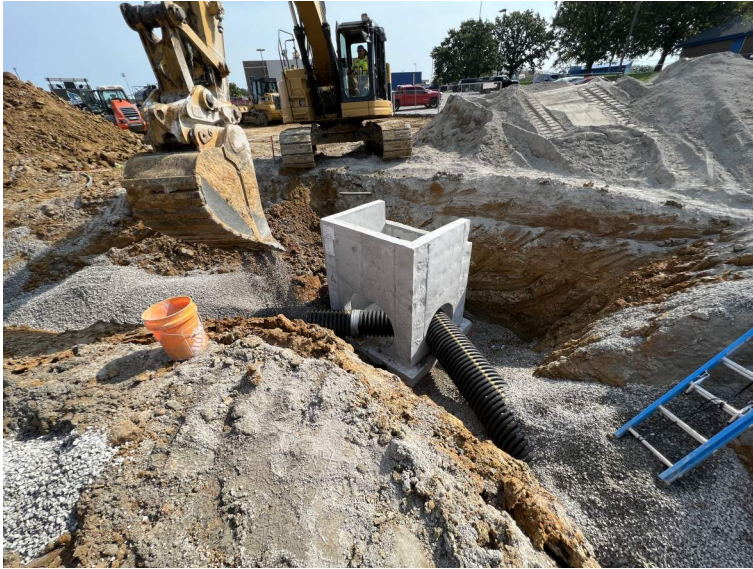
Site Storm Boxes / Drainage