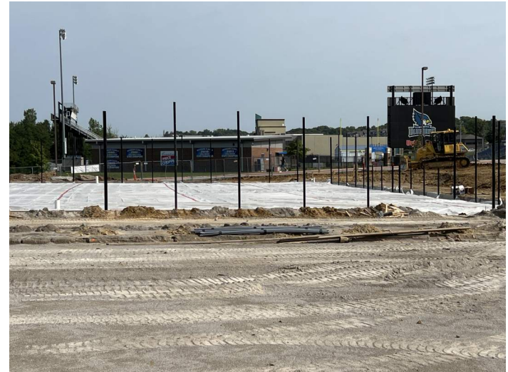
Looking North from South Courts