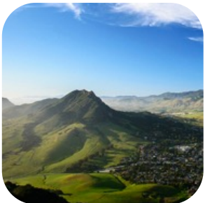
San Luis Obispo