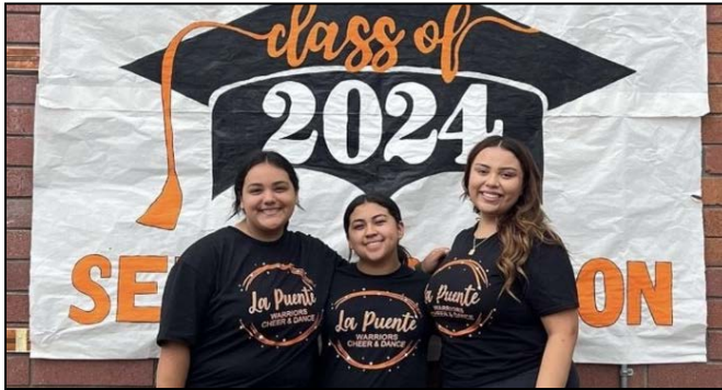
La Puente High School announces its dance captains for the 2023-24 season with a team celebration during the first day of school on Aug. 9.