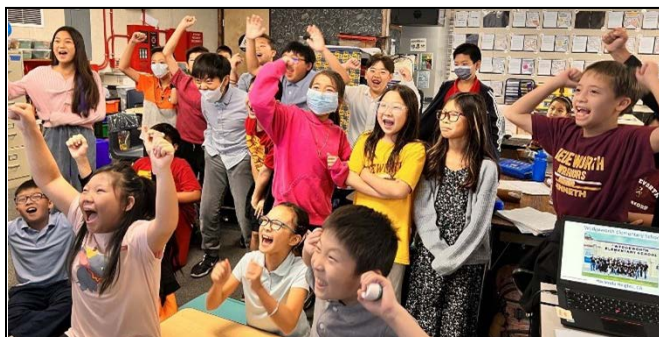
Wedgeworth Elementary School students and staff celebrate being named a National Blue Ribbon School during a nationwide video announcement released on Sept. 19.

Four Hacienda La Puente Unified schools were named 2023 National Blue Ribbon Schools by the U.S. Department of Education on Sept. 19, recognizing public and private elementary, middle and high schools' academic excellence and success in closing achievement and opportunity gaps.