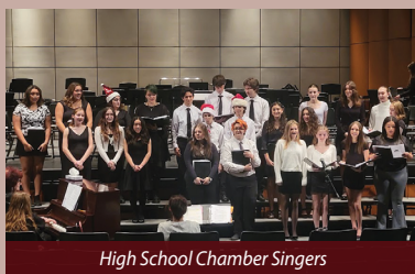
High School Chamber Singers