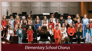
Elementary School Chorus