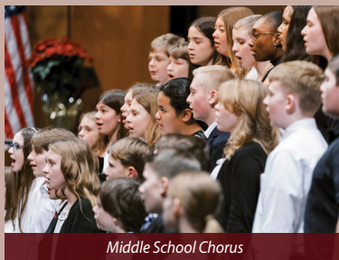
Middle School Chorus