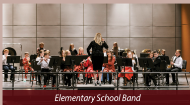
Elementary School Band