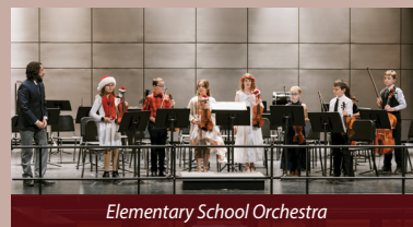
Elementary School Orchestra