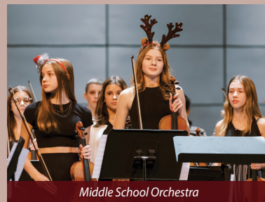
Middle School Orchestra