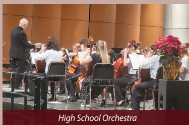
High School Orchestra