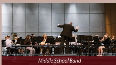
Middle School Band