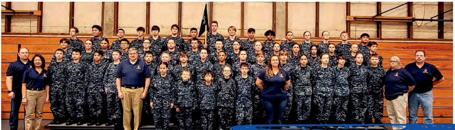
Sea Cadets at Cedar Heights Middle School.

Joining the Sea Cadets is about growth and exploration, with no obligation to join the Navy or any other military branch. It is a chance to learn, grow, and become a part of something bigger!