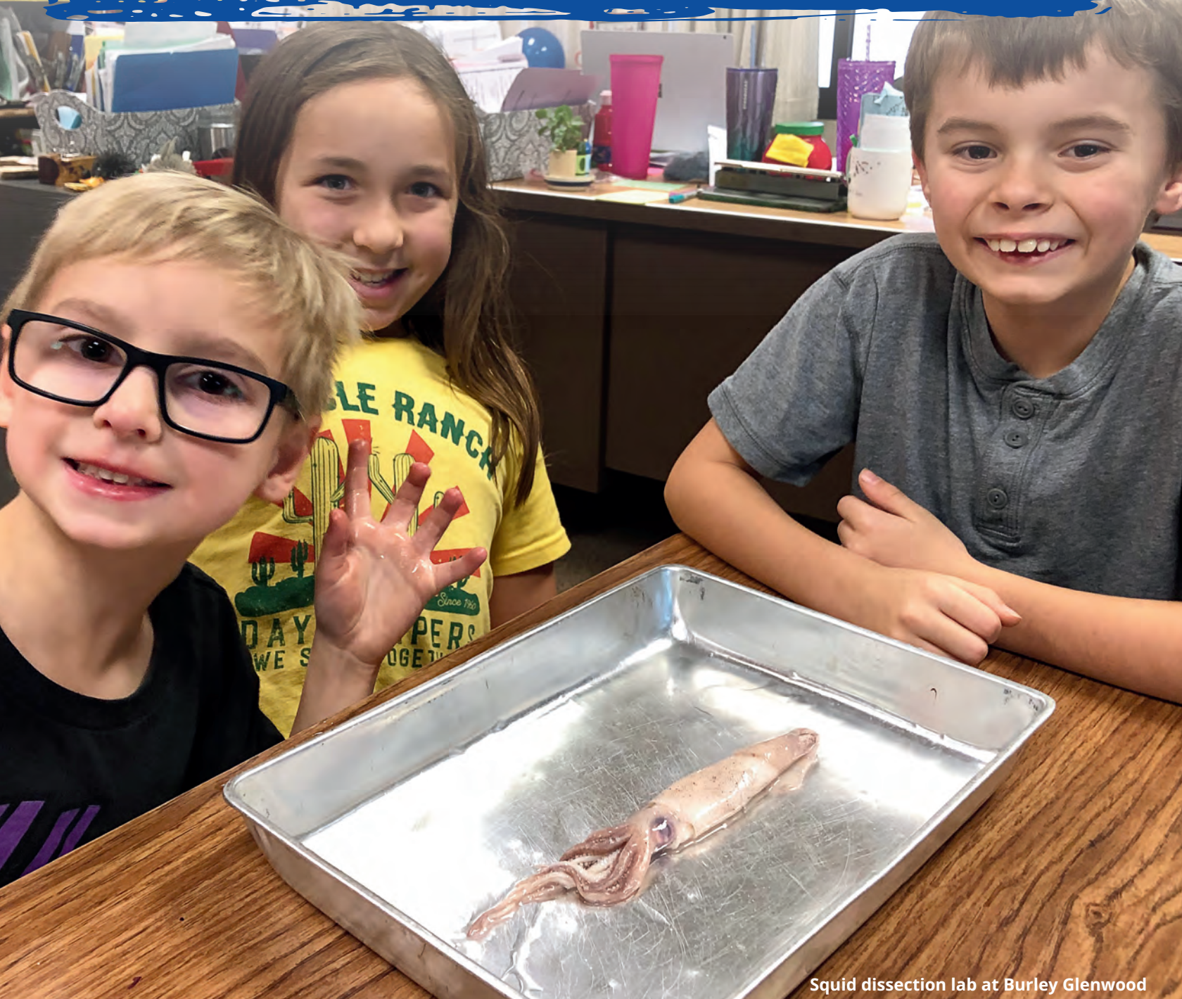
Squid dissection lab at Burley Glenwood