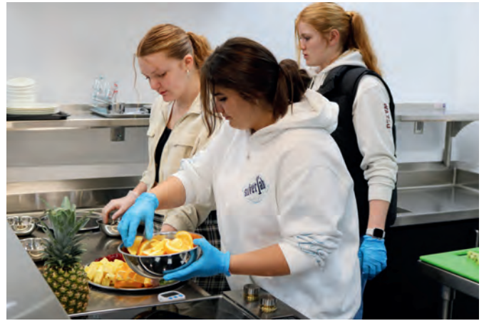
SKHS students at work in the new culinary lab.