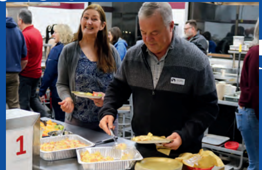
SKHS students and staff at the culinary lab ribbon cutting breakfast.