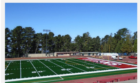
Skyline Turf Field Replacement

Students and the greater community have enjoyed use of the field and the surrounding track at Skyline High School since 2002. Over time, frequent use of the turf and track have required its replacement. In Summer 2015, the existing turf was removed and a new synthetic turf athletic field was installed. The track was resurfaced and the existing drainage system was flushed out. An access road with new concrete v-ditches was also replaced.