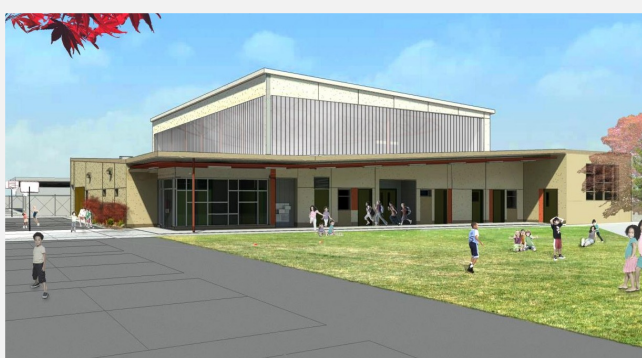
Future Multipurpose Building

Phase 2 of the grade expansion of Greenleaf Elementary School from K-5 to K-8 is construction of a new 14,646 square foot two story classroom building and a new 9,600 square foot multipurpose and flex classroom building. The new classroom building will be a high performance building featuring good lighting, clean air, and comfortable classrooms to create healthy learning environments for students. It will house offices and a library.