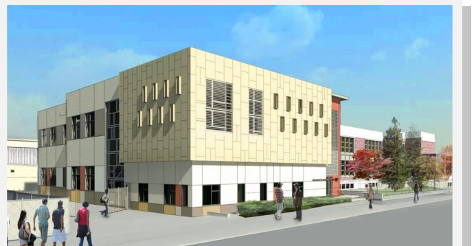
Future Two Story Classroom Building