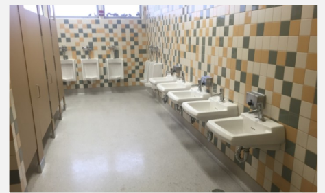
Sobrante Park Restroom Renovation

Decorative wall tile was installed to create a colorful and bright background in the restrooms. Renovations were pilot projects for a new high efficiency/high power hand dryer. A total of 58 toilets, 36 sinks and 25 urinals have been replaced so far.