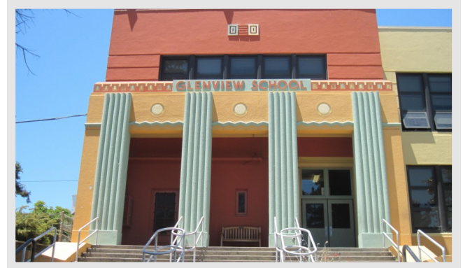
Existing Glenview Elementary Front Entrance Façade