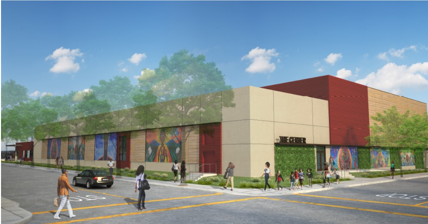
The Center: Central Kitchen and Education Center*