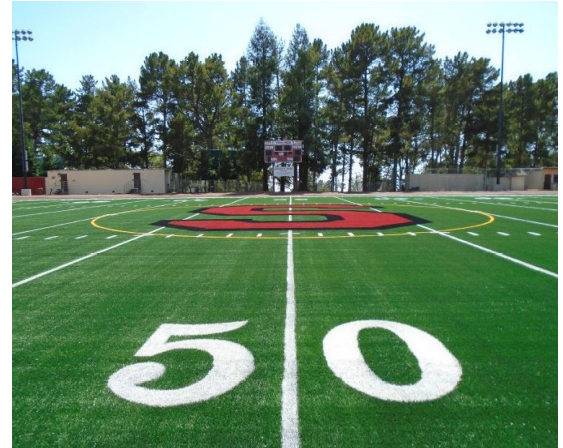
Skyline High School Turf Field Replacement **