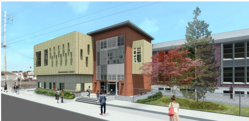
Greenleaf at Whittier Elementary School Campus Grade Expansion: New Two Story Classroom Building and Kinder Campus ***