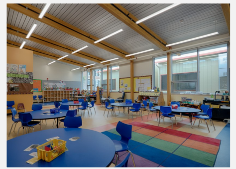
Greenleaf Kinder Campus Classroom

To support the site grade expansion of Greenleaf Elementary School from K-5 to K-8, new construction and upgrades will be completed to the existing systems at the Whittier Elementary School Campus. In Summer 2015, 9 portable classrooms were demolished to provide space for the new kinder campus. In their place, 2 pre-fabricated, modular buildings featuring 4 spacious classrooms were installed. The classrooms have an abundance of natural daylight, interior toilets and sinks, and state-of-the-art teaching walls. The kinder campus houses the Transitional Kindergarten and Kindergarten classes. Also demolished in Summer 2015 was the auditorium, which will be replaced by a new multipurpose and flex classroom building.