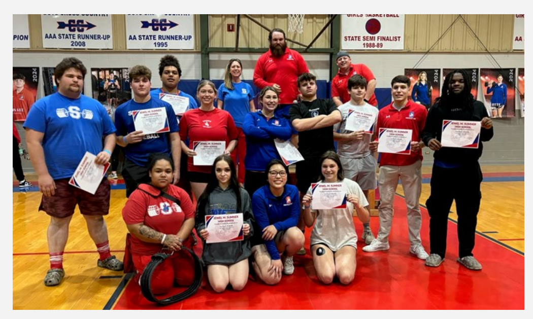
Cowboy Invitational Powerliftina Meet 1/27/24