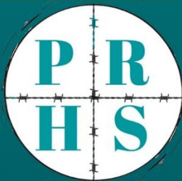
Pine Ridge Show Team