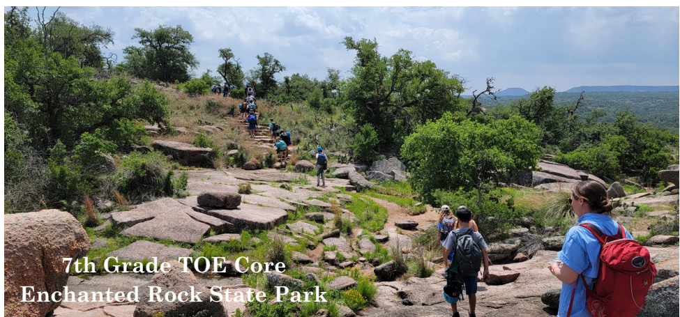
7th Grade TOE Core Enchanted Rock State Park