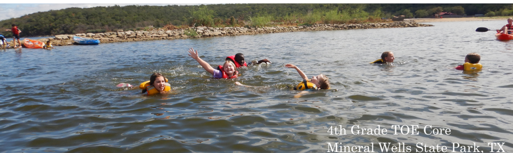
4th Grade TOE Core Mineral Wells State Park, TX

Students spend two days and one night at Mineral Wells State Park. They camp in screened shelters as a building block to prepare them for tent camping in 5th grade. A big component of our fourth-grade TOE Core trip is healthy risk taking. Students climb outdoors, kayak and swim on the lake, and participate in an adventure race. Many of these activities are presented to students for the first time during this Core event. The emphasis on pushing one's comfort zone is a primary goal of fourth-grade TOE Core trip.