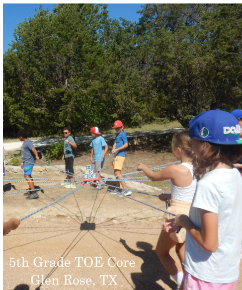
5th Grade TOE Core Glen Rose, TX