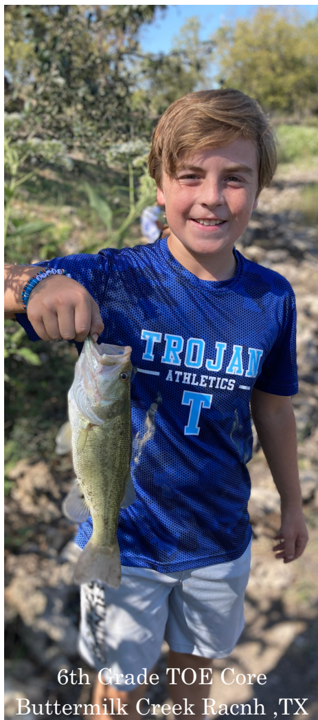
6th Grade TOE Core Buttermilk Creek Ranch, TX